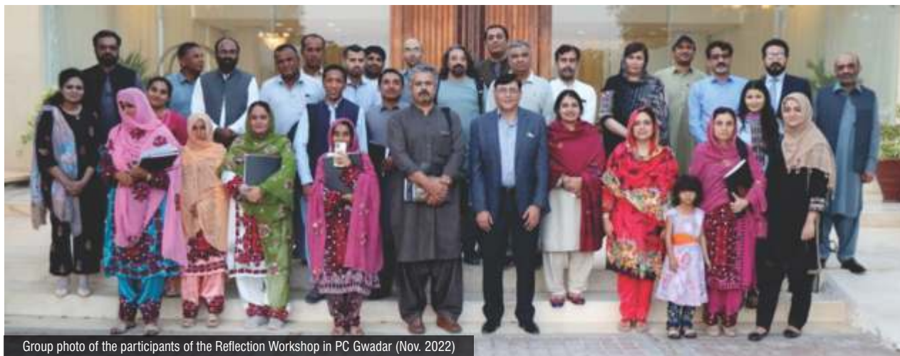
Group photo of the participants of the Reflection Workshop in PC Gwadar (Nov. 2022)

The BRACE Programme started in July 2017 and its current No-Cost-Extension will conclude in June 2023. As the programme comes to an end, RSPN organised field visits to district Kech and a Reflection Workshop in Gwadar in November 2022. The objective of this workshop was to understand and document the challenges faced during the implementation period, how these challenges were addressed, which strategies proved to be effective on the field and what interventions failed to deliver the expected outcomes. This exercise was pivotal to