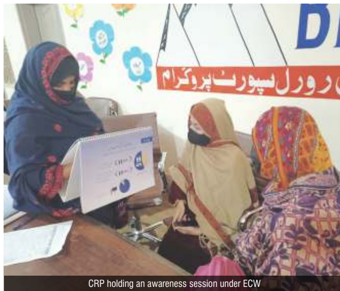
CRP holding an awareness session under ECW

Education Cannot Wait (ECW) is the first global fund dedicated to education in emergencies and protracted crises. The fund's Multi-Year Resilience investment window addresses longer-term needs through multi-year joint programs in protracted crises, enabling humanitarian and development actors to work together on delivering collective education outcome. The MYRP will be implemented as a partnership between the Government of Pakistan and a consortium led by UNICEF, Voluntary Service Overseas and the Rural Support Programmes Network in Balochistan and Khyber-Pakhtunkhwa. RSPN's Education Cannot Wait (ECW) is being implemented by Balochistan Rural Support Programme (BRSP) in three Districts of Balochistan i.e., Loralai, Panjgur, and Kohlu.