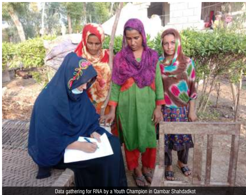
Data gathering for RNA by a Youth Champion in Qambar Shahdadkot

The project is currently implemented in two districts of Sindh Matiari and Qambar Shahdadkot with the support of National Rural Support Programme (NRSP) and Sindh Rural Support Organization (SRSO) in 28 Union Councils. Adolescents and Youth of age 15-24 are selected by the Community Institutions (CIs) as Youth Champions (YCs) to establish peer group network, deliver awareness sessions on RHR Toolkit and begin conversations on early marriages, birth control, gender based violence, puberty and reproductive health rights (for married youth), female education and child labor.