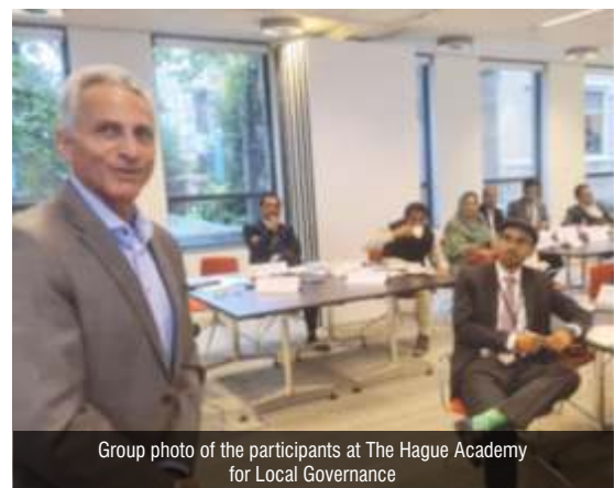
Group photo of the participants at The Hague Academy for Local Governance

Under the BRACE Programme, a delegation of senior officials from the Government of Balochistan completed a week-long training and study tour at the Hague Academy for Local Governance (HAfLG) in the Netherlands. International experts facilitated interactive and encouraged learning from case studies from comparable developing nations across the globe who had excelled in various aspects of community development and local governance. In the Dutch capital, the Embassy of Pakistan hosted a meeting and participants also visited Rotterdam and Amsterdam where they met community-based organisations and local councillors of the Dutch municipalities. The delegation of 20 participants also had representation from the implementing partners of the BRACE Programme including RSPN.