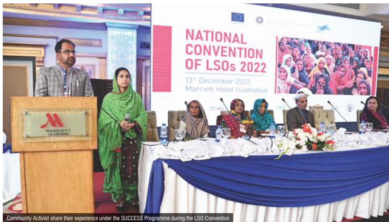
Community Activist share their experience under the SUCCESS Programme during the LSO Convention

The Rural Support Programmes Network (RSPN) organised the annual national convention of the Local Support Organisations (LSOs) on 13th December 2022. The convention is a platform to interact with LSOs (Community based institutions at the Union Council Level), donor agencies, development partners and other stakeholders to share local knowledge and learn from their experiences of implementing community driven development approach in Pakistan's rural communities.