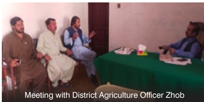
Meeting with District Agriculture Officer Zhob

The LSO representative held a meeting with the office bearers of agriculture department in district Zhob, where they were provided with 511 trees by the office bearers. The provided trees were distributed among different villages of the union council. The Village organisation members made sure all the trees are planted and taken care of so they can grow properly and reduce the effects of climate change as much as possible. The villagers not only appreciated both the LSO members and the office bearers of agriculture department but also thanked them for their efforts.