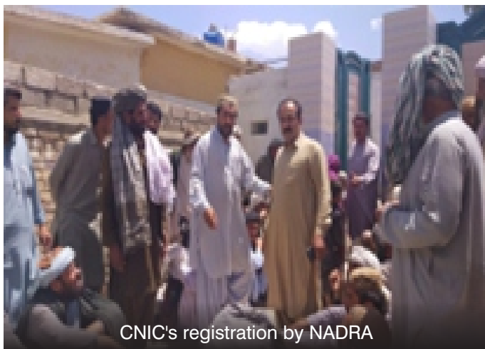
CNIC's registration by NADRA

The village Organisations representatives requested to the LSO representatives to resolve the issue of CNIC's that a lot of villagers don't have CINC's. The LSO representative visited different villages of the union council and they then held a meeting with the NADRA officials, district Zhob and requested their support for the said purpose. The officials ensured their support. A team with NADRA van were sent to the village to facilitate the villagers in the process. 110 residents were registered in total including 47 female applicants.