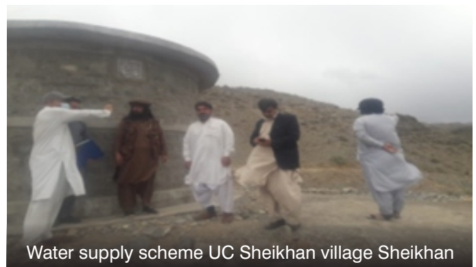
Water supply scheme UC Sheikhan village Sheikhan

The villagers of Sheikhan called a meeting with LSO and requested the LSO representatives to resolve their problem by constructing a water supply scheme for villagers to lessen their difficulties regarding drinking water. The LSO representatives checked the proposed site of the area and estimated that it would cost 0.9 million. Therefore, they decided to do resource mobilisation for construction of the water supply scheme. Meetings were held with the BRSP district