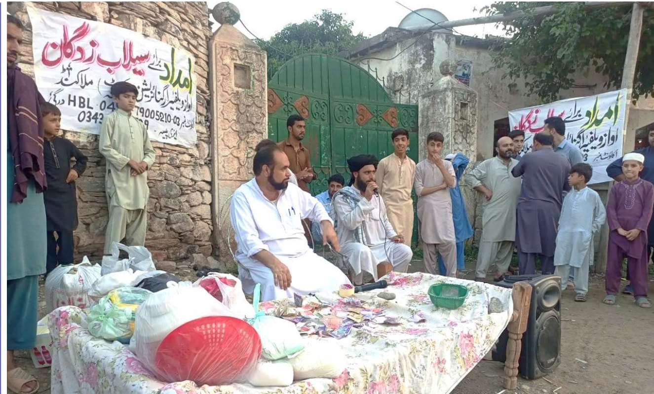
NRSP fostered LSO Awaz in district Malakand leading a fundraising campaigns for flood affected families