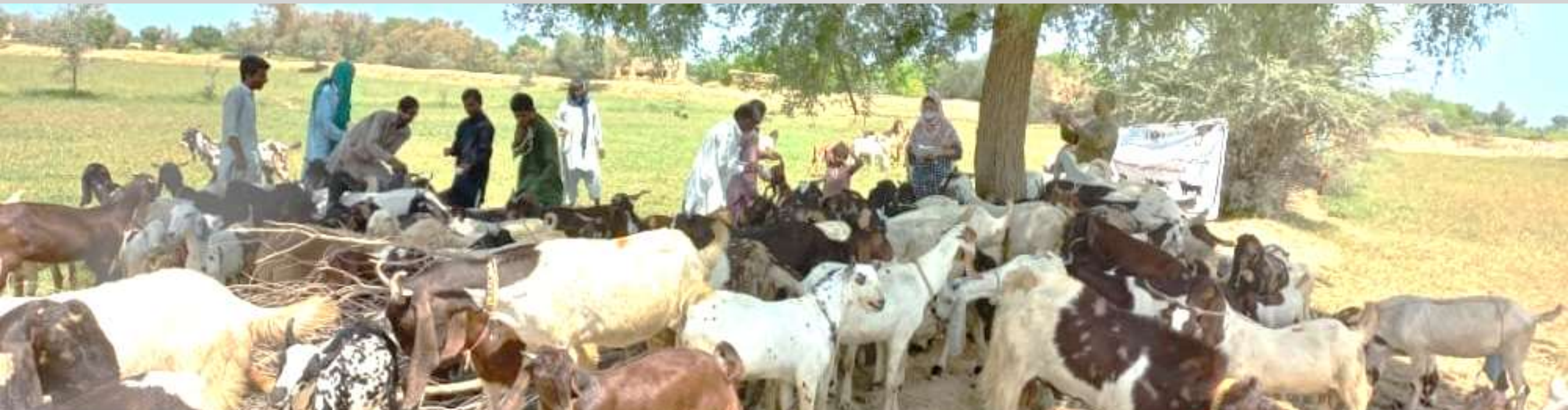
Free veterinary livestock camp organised by TRDP in collaboration with the Animal Husbandry Department of Jamshoro district in Taluka Kotri and Sehwan of Jamshoro district.