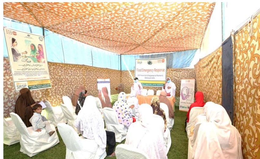
Women Friendly Health Spaces in Charsadda