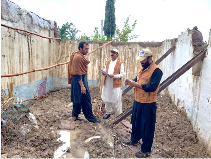
BRSP team undertaking damage assessment in Loralai