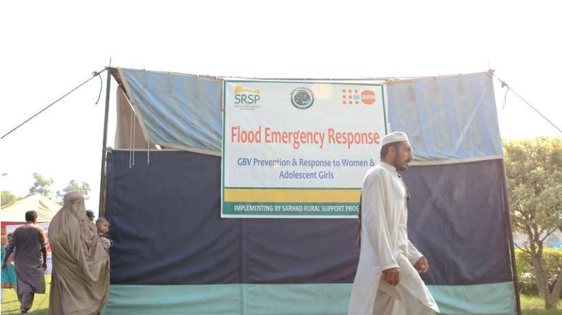
Women Friendly Health Spaces in Charsadda, 105 women and girls accessed the Space on the day to acquire health and psychosocial support services