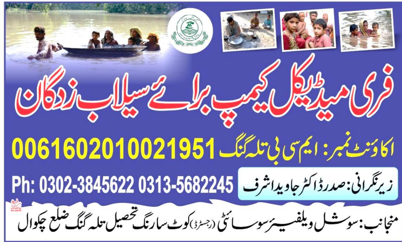
NRSP fostered LSO Kot Sarang in district Chakwal arranging a freed medical camp for flood affected families