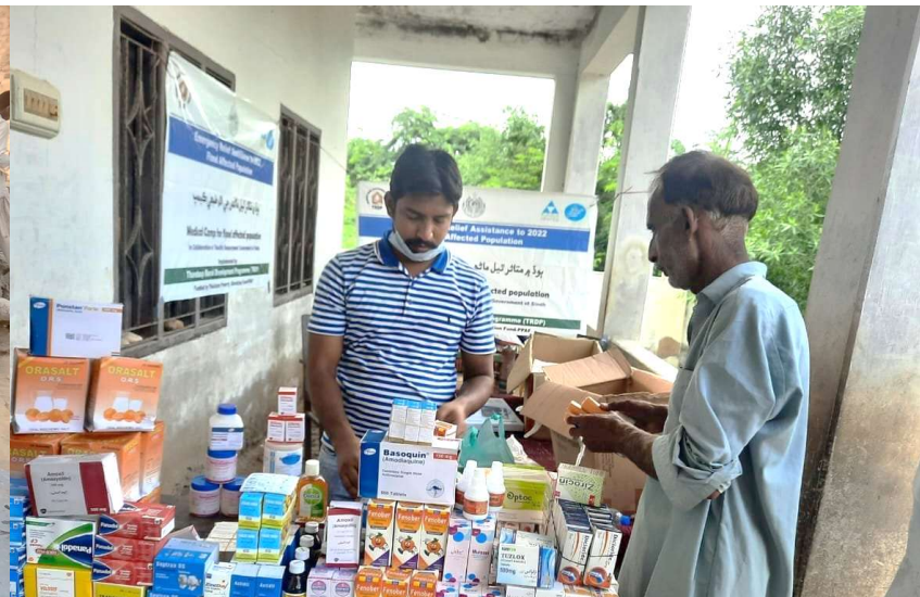
TRDP with support of PPAF organised free medical camp at Taj Muhammad Kapri village of Mirpurkhas - 200 patients were treated and free medicines provided