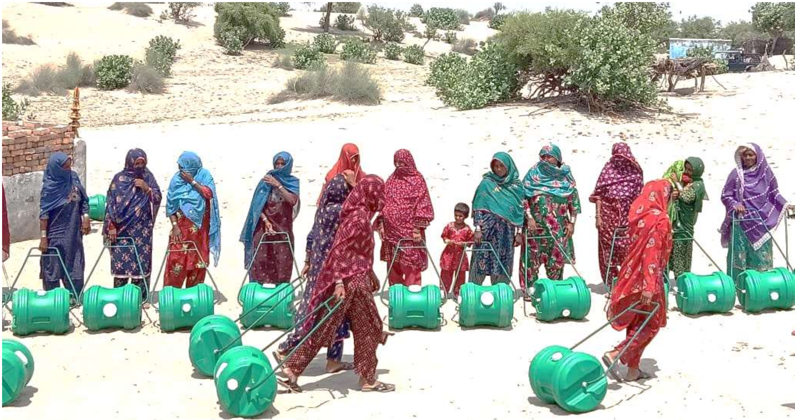
62 H2O Wheels distributed among communities in Sanghar by SRSO