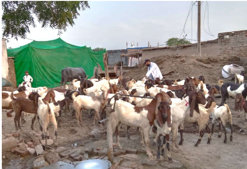
1,658 animals treated at vaccination camp organised by SRSO in Village Haji Mohammad Bhatti and Ahmed Khan Babar, Taluka Mattli - Badin