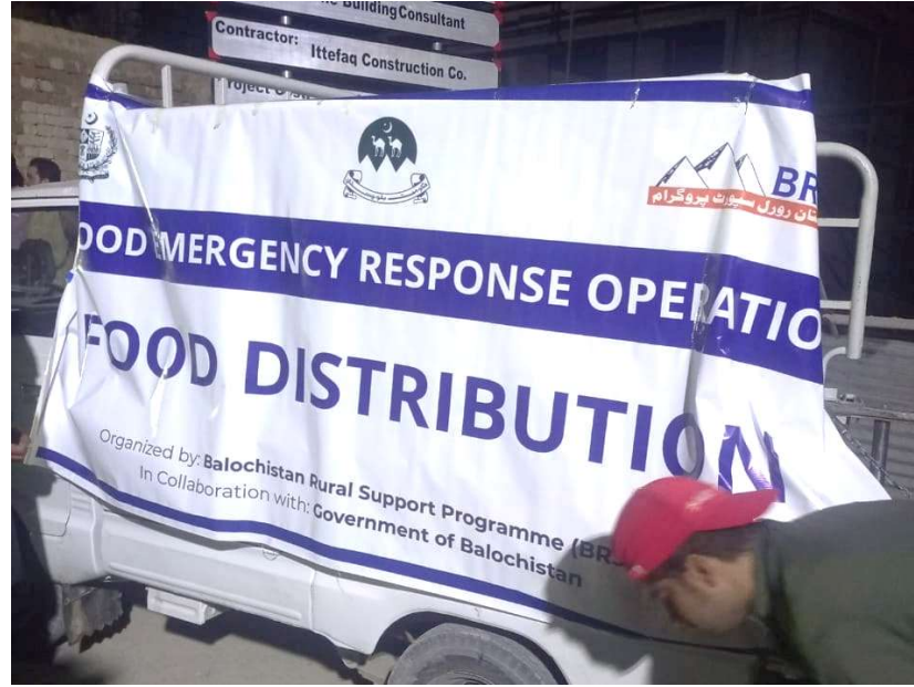
BRSP distributed cooked food and clean drinking water among approx. 2,750 affected people including women and children in Quetta