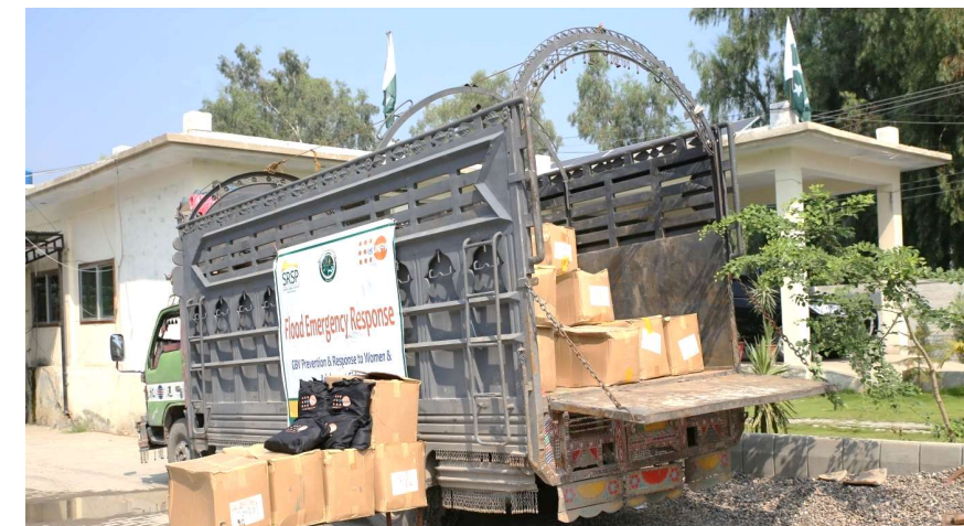
1,000 dignity kits handed over to Additional Deputy Commissioner, Nowshera through UNFPA support