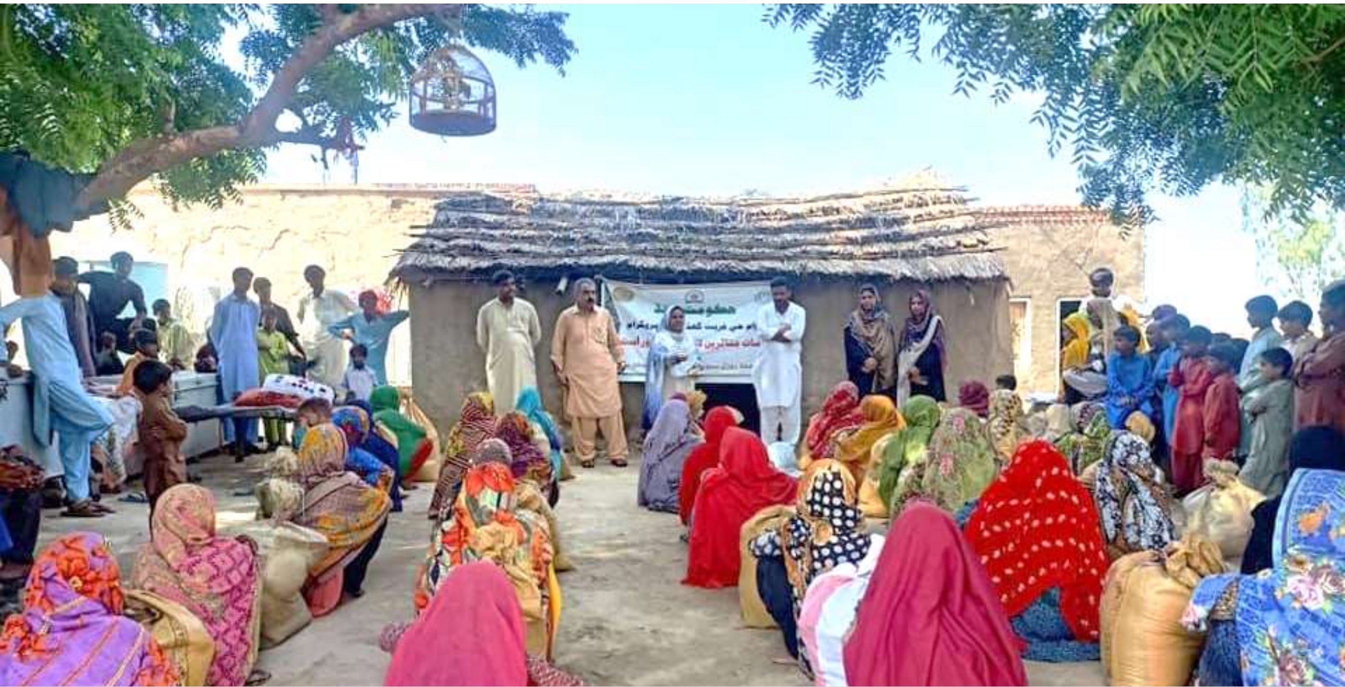
SRSO distributed 76 ration bags among flood affected families from UC Junas, Roopahar, Pano Ghulam Ali, Sadhuja and Nindapur of district Sukkur