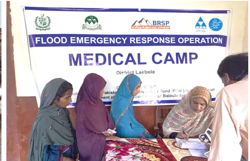
A medical camp organised by BRSP at Kund Malir - Lasbela where free medicines provided to 320 men, women and children with support of district health dept. and administration