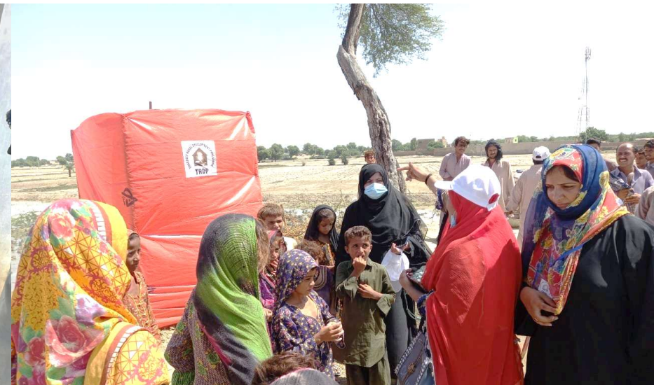
TRDP team constructed pit latrines for affected families in Khairpur Nathan Shah, Dadu