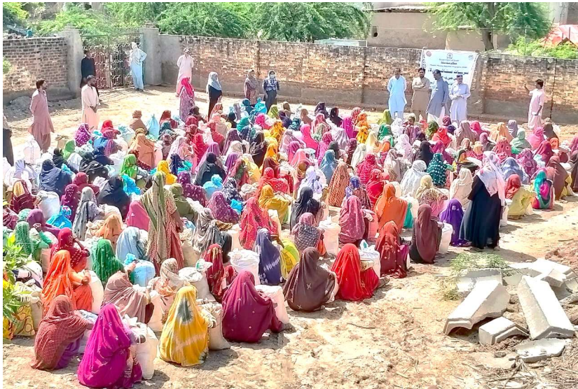
Distribution of ration bags and stitched cloths by SRSO among 200 IDPs families of Taluka Jhudo & Digri at Village Choudhry Ahmed Hassan of UC Mir Khuda Bux - Mirpurkhas