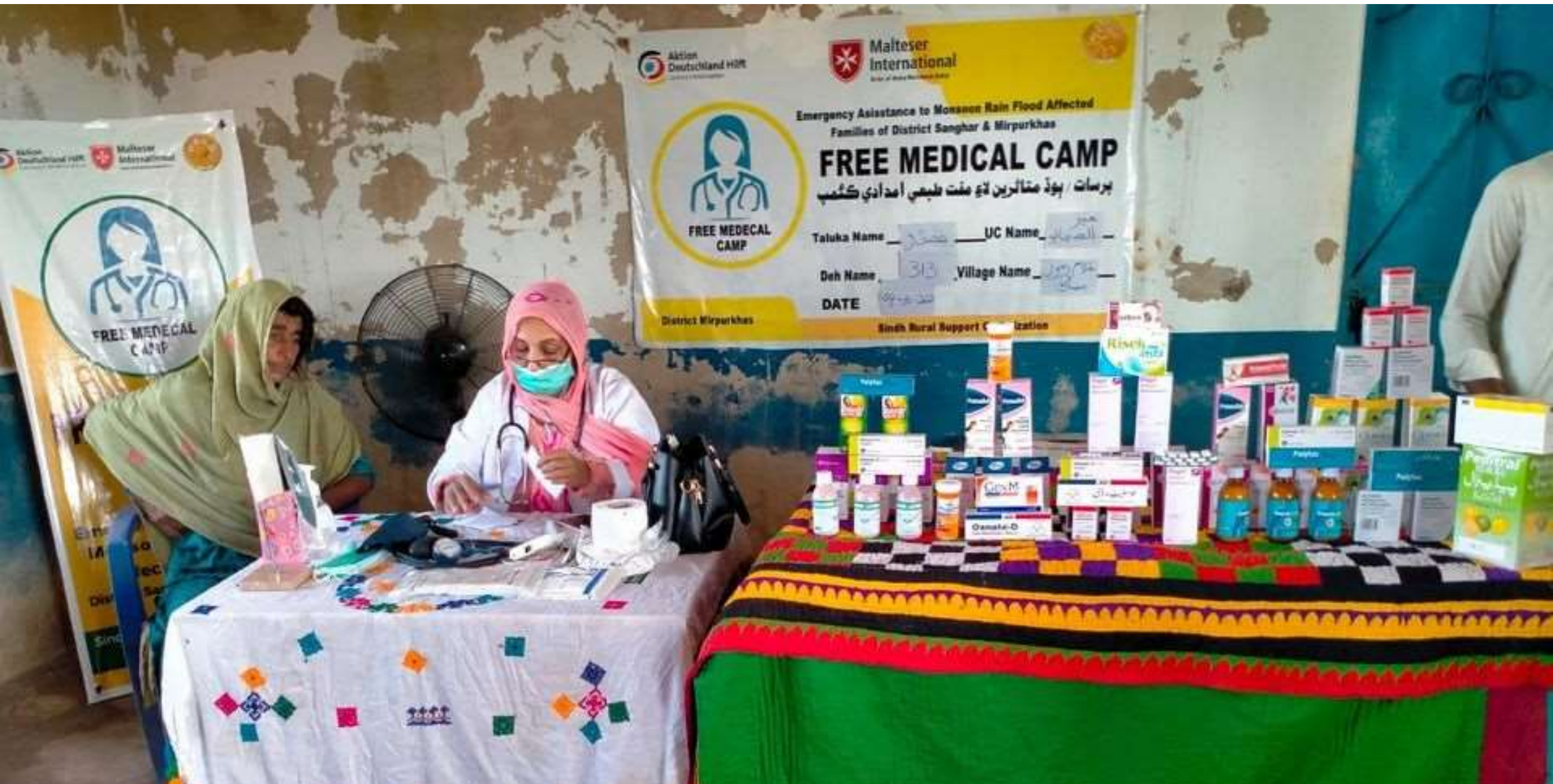
SRSO team organiaed a medical camp with the support of Malteser International at Village Ghulam Hussain Pathan, UC Mir Allah Bachayo Taluka Jhudo of Mirpurkhas district.