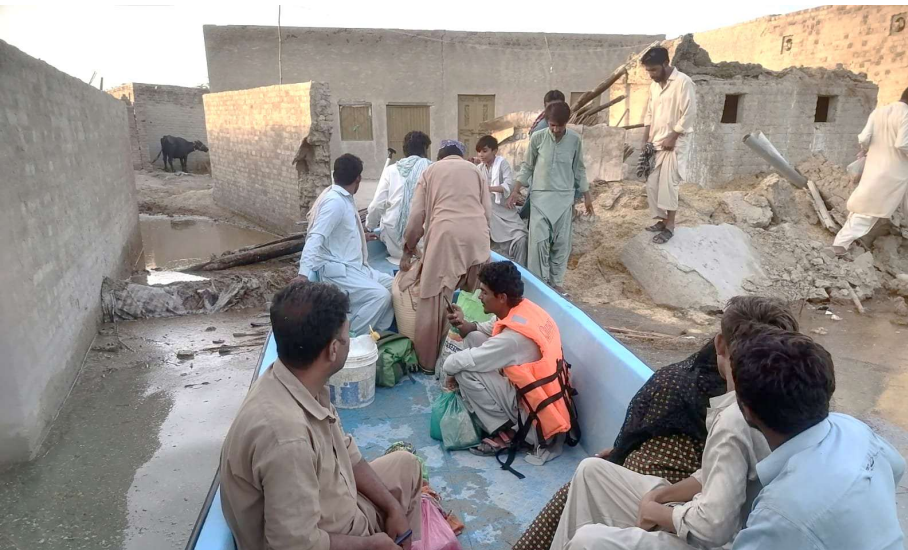
TRDP team rescued locals of Johi and Khairpur Nathan Shah (Dadu), provided drinking water and medical aid to displaced families