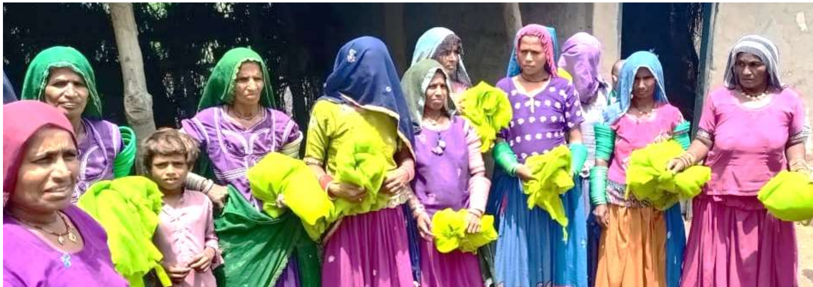
Distribution of mosquito nets by NRSP team in Tando Allahyar district

SUMMARY DETAILS OF RSPs FLOOD RESPONSE WORK