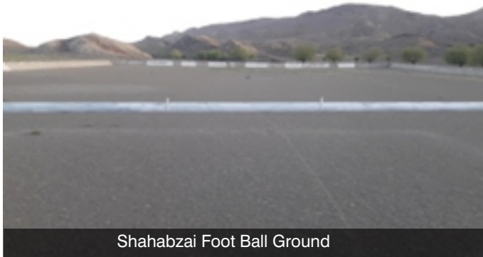
Shahabzai Foot Ball Ground

The youngsters of village Shahabzai conducted a meeting regarding the construction of a football ground in the village for a good and healthy environment. They meet with LSO representatives and Shahabzai Committee for the demand of ground. LSO decided to do resource mobilisation for the construction of the football ground. After that, the LSO representatives contacted Minister Haji Mitta Khan Kakar and asked for a football ground for the boys of his UC village Shahabzai. Finally, Minister Haji Mitta Khan Kakar set aside a fund of Rs. 3.8 million for the village, and the union council approved it for the village football ground. The ground was made in the month of July-2021. The youth of the village are very happy. And they thanked LSO, Shahabzai Committee, and Minister Haji Mitta Khan Kakar