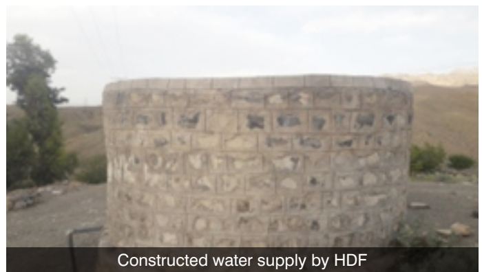
Constructed water supply by HDF

The villagers of Shahabzai and Qila Sherak called a meeting with LSO. They requested the LSO representatives to resolve their problem by constructing a water supply scheme for villagers to resolve the drinking water issue. The LSO representatives checked the proposed site of the area and estimated that it would cost 1.5 million. Therefore, they decided to do resource mobilisation to construct the water supply scheme. The first held meetings with