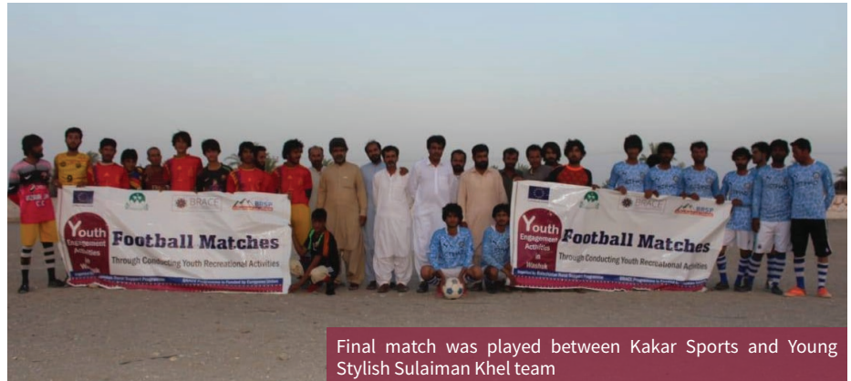
Final match was played between Kakar Sports and Young Stylish Sulaiman Khel team

To engage youth in a healthy and recreational activity, football matches were organised with more than 150 players from different teams in Union Council Ajram, District Pishin. Altogether, 16 teams participated and