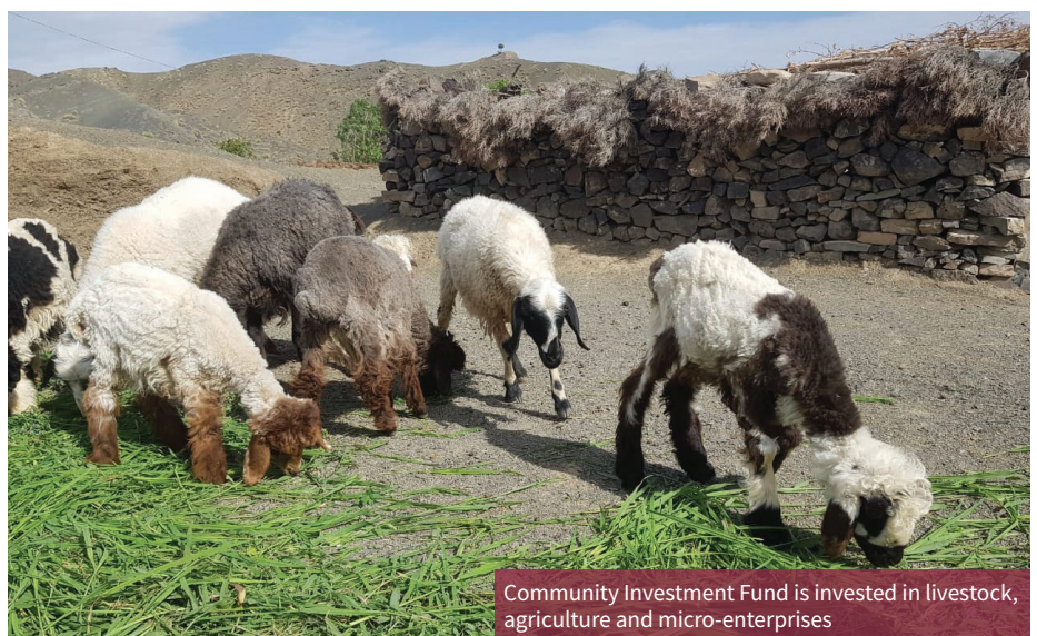
Community Investment Fund is invested in livestock, agriculture and micro-enterprises

The beneficiaries, as listed in the records, are overwhelmingly women, but activities supported through the three interventions are household activities: the listed recipients as well as the spouses are involved in decision making, and the spouses and other household members often contribute labour. Approximately 65 percent of the female beneficiaries contribute labour to income-generating activities, but their dependence on their husbands is greater than that of the men on their wives.