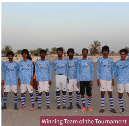
Winning Team of the Tournament