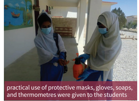
practical use of protective masks, gloves, soaps, and thermometres were given to the students

This awareness session will be continued in the coming days to all the schools and other religious seminaries of the Union Council.