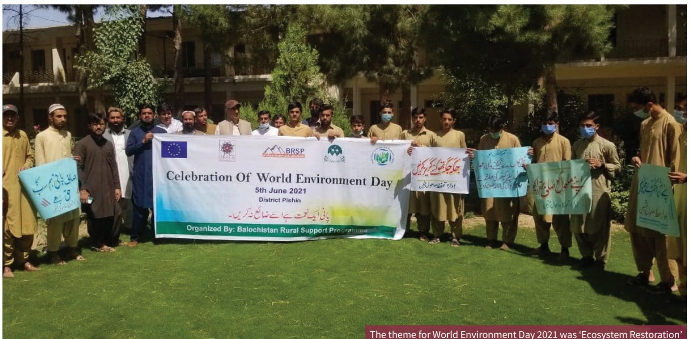
The theme for World Environment Day 2021 was 'Ecosystem Restoration'