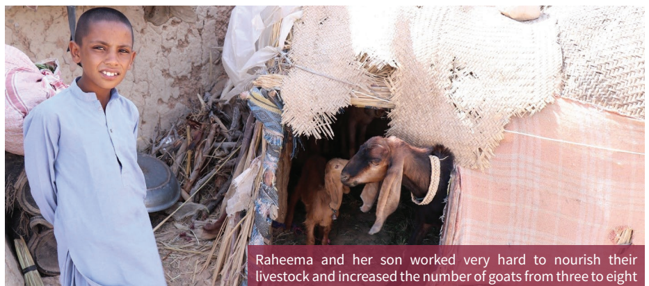
Raheema and her son worked very hard to nourish their livestock and increased the number of goats from three to eight

This Programme is an opportunity for action towards achieving full rights and recognition for widows. This includes providing them with