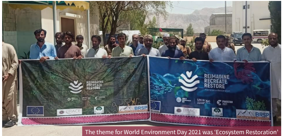
The theme for World Environment Day 2021 was 'Ecosystem Restoration'

The theme for World Environment Day 2021 was 'Ecosystem Restoration'. This year, World Environment Day will kick off the United Nation Decade on Ecosystem Restoration (2021-2030), a global mission to revive billions of hectares from forests to farmlands; from the top of the mountains to the depth of the seas. Moreover, to stimulate attention and actions for