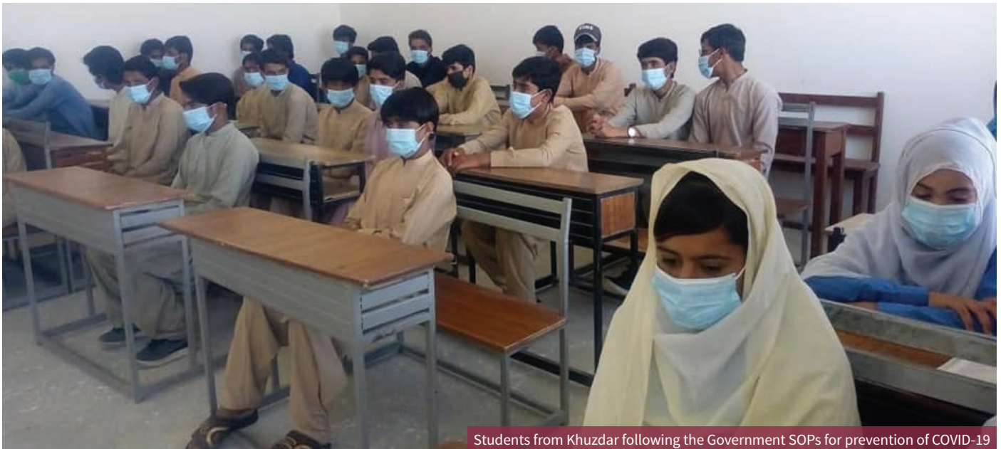
Students from Khuzdar following the Government SOPs for prevention of COVID-19