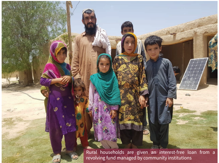
Rural households are given an interest-free loan from a revolving fund managed by community institutions

The survey also revealed that 47 percent of interest-free loan beneficiary households, 45 percent of productive grants beneficiary households and 51 percent of TVET beneficiary households to higher band of the poverty scorecard, from lower band 0-23 (poorest band) to 24-100, non-poor band.