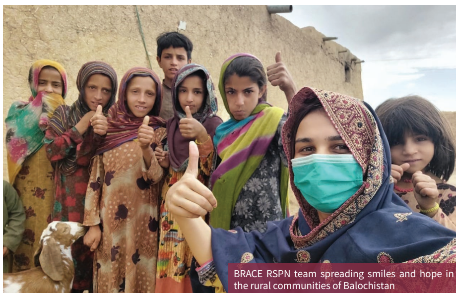
BRACE RSPN team spreading smiles and hope in the rural communities of Balochistan

The Institute for Public Opinion Research (IPOR) conducted a survey, commissioned by RSPN in three districts of Balochistan (Kech, Khuzdar and Loralai) in April 2021 to assess how the European Union supported Balochistan Rural Development and Community Empowerment (BRACE)