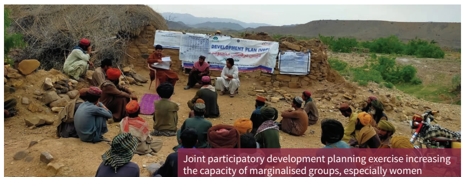
Joint participatory development planning exercise increasing the capacity of marginalised groups, especially women

marginalised groups, especially women to state their rights through resolutions but also hold local authorities responsible for resource mobilisation, execution of relevant and efficient public service delivery.