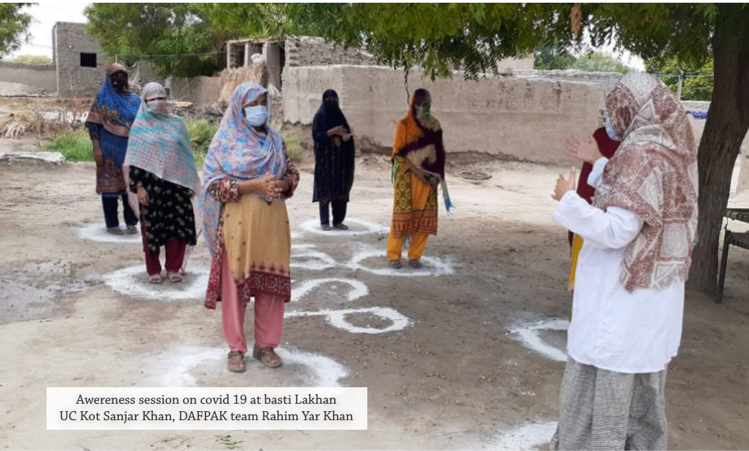
Awareness session on covid 19 at basti Lakhani UC Kot Sanjar Khan, DAPPAK team Rahim Yar Khan