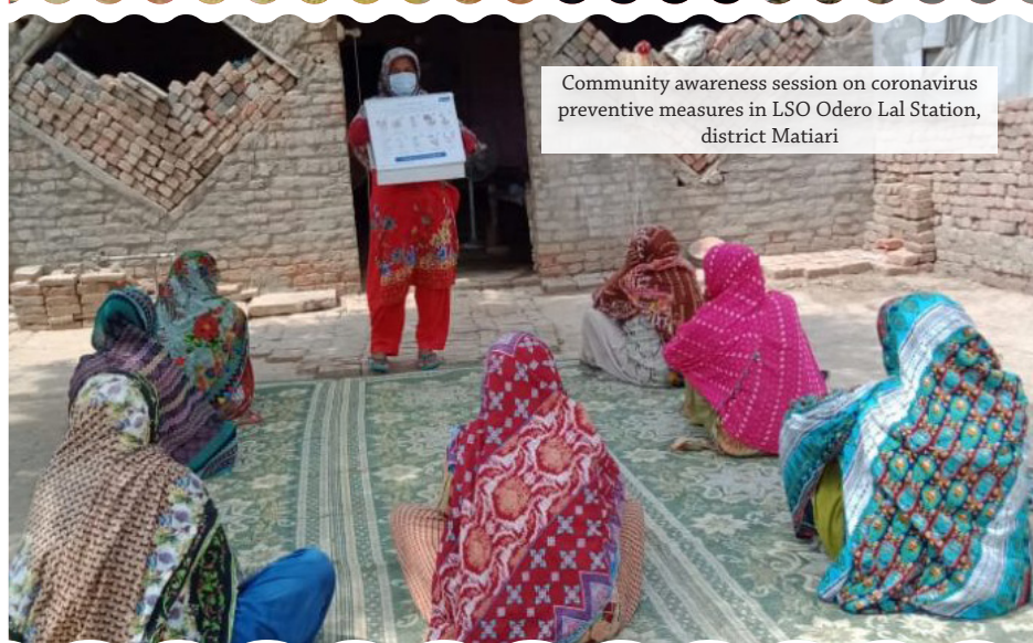
Community awareness session on coronavirus preventive measures in LSO Odero Lal Station, district Matiari