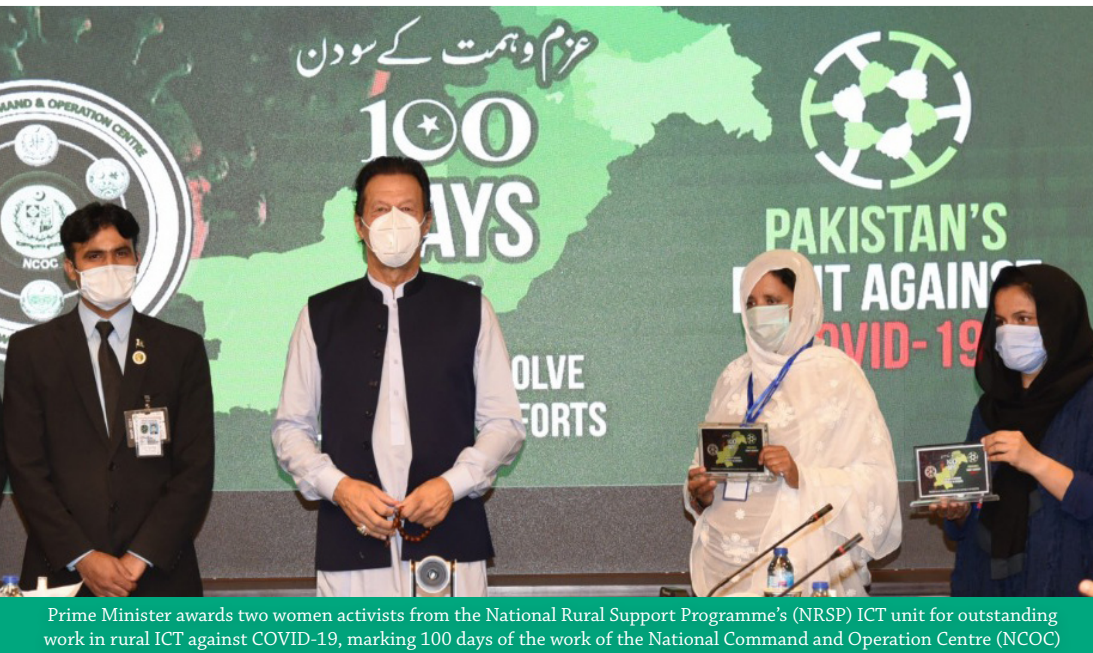
Prime Minister awards two women activists from the National Rural Support Programme's (NRSP) ICT unit for outstanding work in rural ICT against COVID-19, marking 100 days of the work of the National Command and Operation Centre (NCOC)