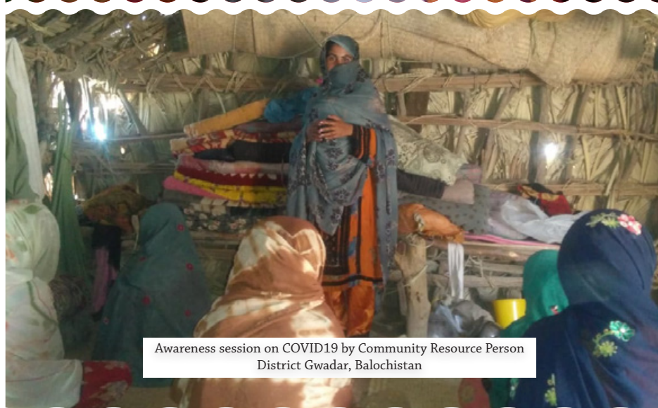
Awareness session on COVID19 by Community Resource Person District Gwadar, Balochistan