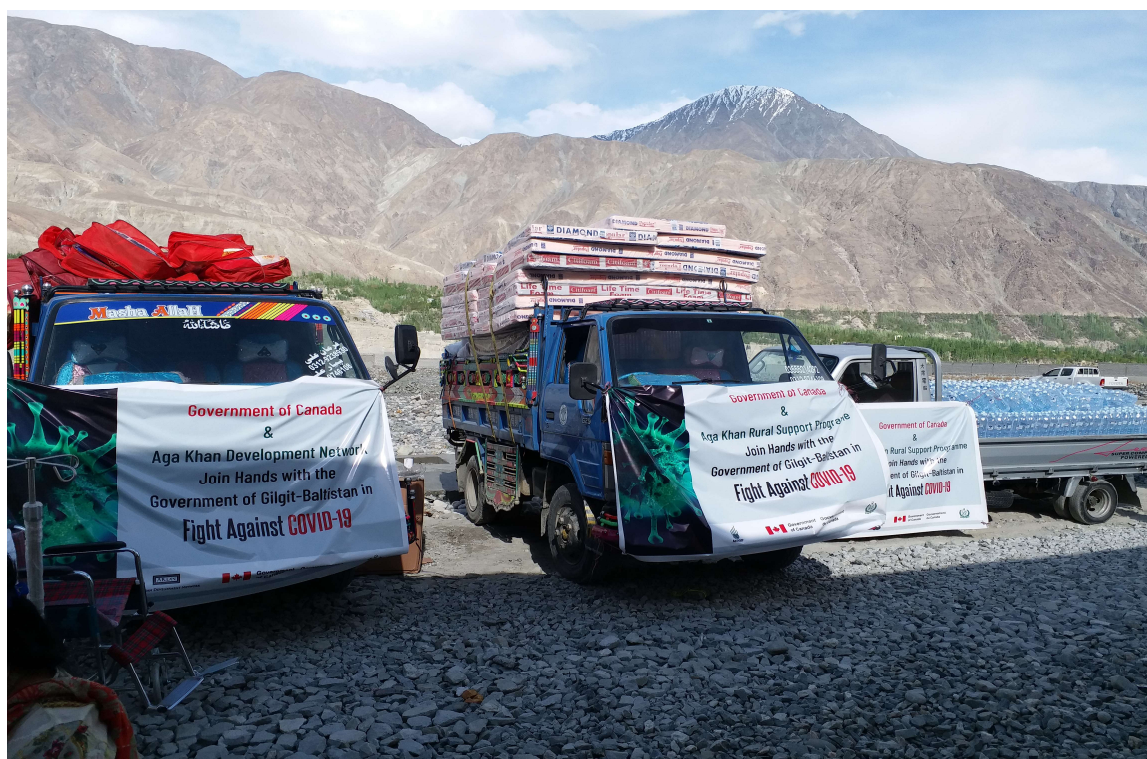
Figure 8: Consignment of Equipment donated by AKDN