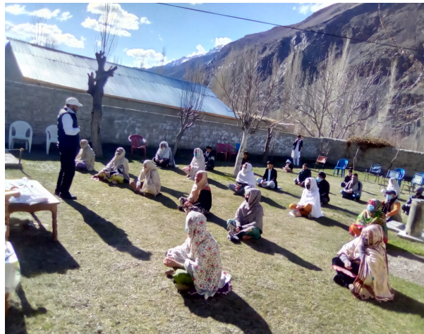
Figure 4: Awareness session with local community members

their respective V/WOs. AKRSP Astore has also embarked upon social mobilization campaign around corona virus through LSOs and CSOs in Astore area. LSOs in Astore district are supporting the government team in finalizing the lists for relief. In district Astore, local cable operators broadcast awareness messages about corona virus and threat it poses. AKRSP in Ghizer has started its campaign for awareness raising with the help of LSOs. Best Town LSO and Al Karim LSO Tawus are playing active role in the campaign.