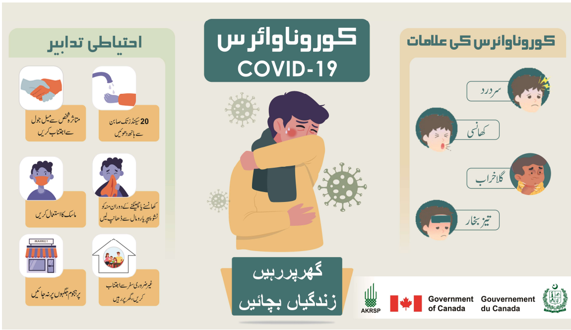
Figure 10: Banner for Display at Tehsil Headquarters