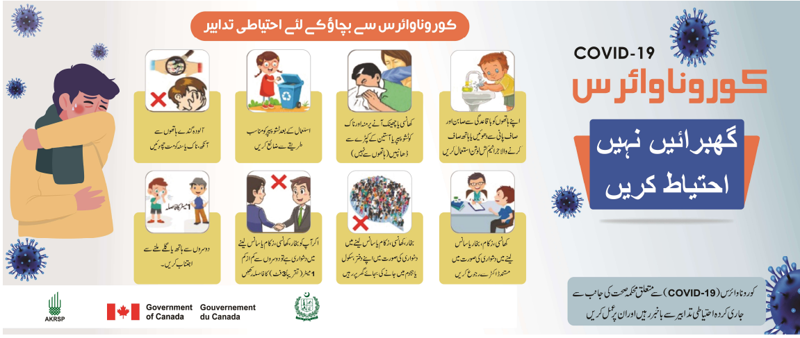
Figure 9: Banner for Display at District Headquarters