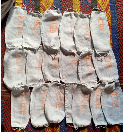
Figure 3: Home made masks in Chitral

Due to AKRSP's extensive mobilization efforts, LSOs of Skardu and Shigar Districts have started awareness campaigns on their own regarding the COVID-19 pandemic in