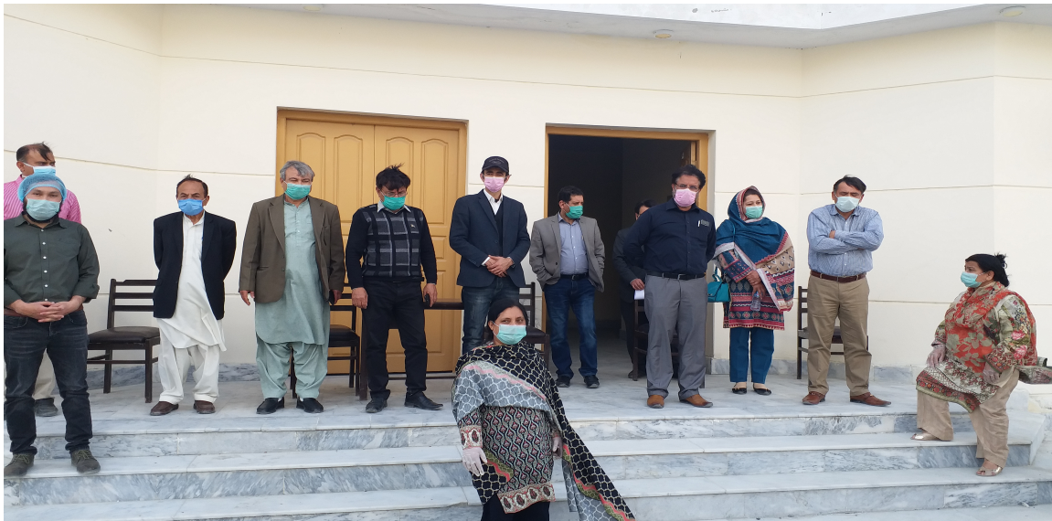
Figure 7: Government Officials, President Ismaili Regional Councils and AKDN Staff are handing over equipment to the government of GB