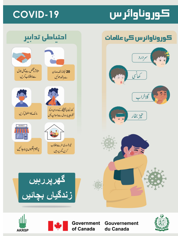
Figure 11: Banner for Display at Union Councils