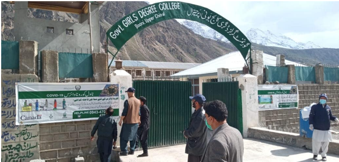
Figure 2: Display of awareness banners at public places

The campaigns are in progress, banners installed in the prominent spots, quarantine centers regarding safety measure. All the LSOs in Upper Chitral have been mobilized to carry out door to door mobilization. Majority of the LSOs have practically started this mobilization through formation of special task force including its board members and mobilizing the local communities in their respective Union Councils regarding the safety measures. BLSO has arranged meeting with district administration and its women social mobilizers are busy in door to door campaigns. UTDN in Upper Chitral have started door to door mobilization and are distributing masks, soaps among the V/WOs in their jurisdiction.