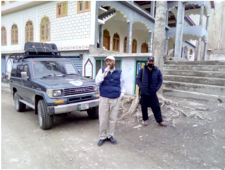
Figure 1 Announcement of Messages on Loudspeaker

local languages. The mass awareness campaign will continue for the next three months so that more and more communities could receive the awareness messages about COVID-19 pandemic. Also, the local communities are equally supporting and following the precautionary measures announced by the government.