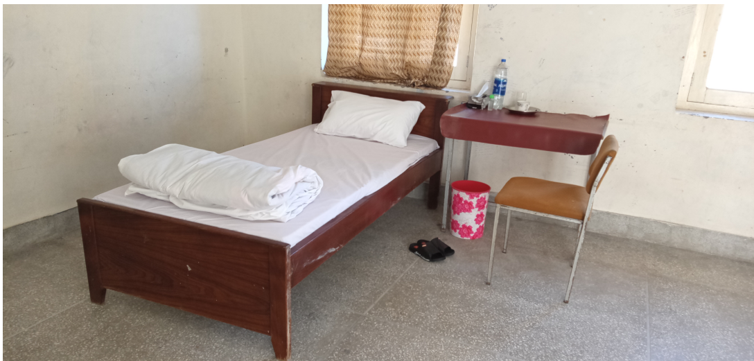
Figure 5: A Room in Isolation Centre in Chitral

AKRSP in partnership with AKHSP and GGDC Booni provided support to District Administration in strengthening of isolation center in Booni having 12 rooms with attached baths. AKRSP support includes provision of beds with foam, pillows, quilts, pillow & quilts covers, sanitary kits (hand wash, sanitizers, toilet & tissue papers) water & food set, warm & cool water system etc.