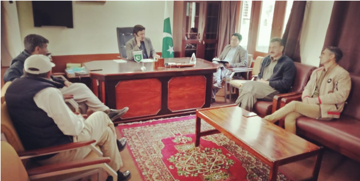
Figure 6: Meeting with Deputy Commissioner Upper Chitral

In the time of Corona crisis, AKRSP has facilitated district administration in transportation of passengers, community coming from other parts of Pakistan and districts to quarantine centers, and from these centres to their homes after completing incubation period. Moreover AKRSP is regularly participating in the district level coordination meeting. The administration was critically facing mobility issues due to lack of resources as well as remote and widespread geographic area. Furthermore the lower Chitral is facing high influx of people from down country due to lockdown across the