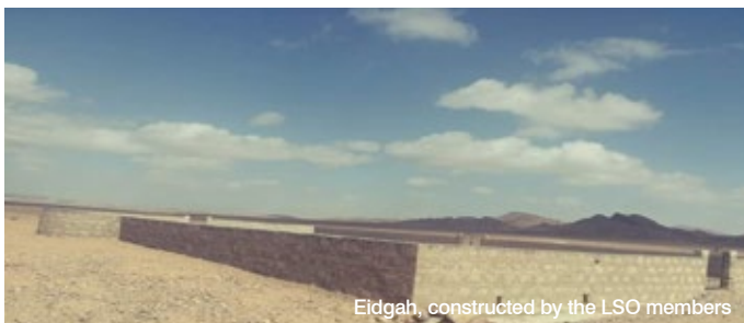
Eidgah, constructed by the LSO members

Muslims offer Eid prayer in an open space called an Eidgah, in their villages and cities. There was no Eidgah in village Hinar Noughy of UC Gowarikh, therefore, people had to prepare a temporary Eidgah by clearing some land on each Eid day, which was a laborious task for them. After organising the community members in COs, VOs and LSO, under the EU supported BRACE Programme, they discussed the need of an Eidgah in their LSO meeting and decided to construct a proper Eidgah. However, they realised that this activity would require a lot of money and labour. The organised members decided to construct the Eidgah by pooling economic resources as well as volunteer-based labour from within their own membership. They collected contributions from each village household, provided free labour themselves and constructed a 115/75 ft Eidgah for their community. It was a great challenge to construct the Eidgah with their limited resources, but the collective approach and unity of the community strengthened their spirits and helped them achieve their goal of constructing the Eidgah for the community. Eighty-five families now have access to a proper Eidgah.