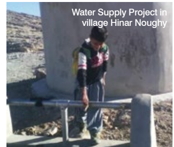
Water Supply Project in village Hinar Noughy