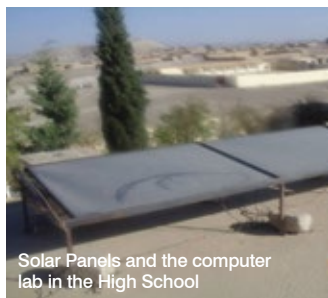
Solar Panels and the computer lab in the High School

With the CSR support, the LSO had established a computer lab in the local Government High School comprising of seven computers. Due to the frequent and long-hours of electricity load shedding, the ceiling fans in the classrooms and teachers' common rooms in the Government High School and the computer lab was almost non-functional. The lack of electricity was negatively affecting the 255 students and 14 teachers of the High School and causing a disruption to their education. The LSO leaders committed to solving the issue by finding way to ensure an undisrupted electricity supply to the High School. Using the personal network of a worker from the LSO area, they met the General Manager of Bolan Construction Company, a private construction company, and explained the problems faced by the students of the school. They requested a solar electricity system to be installed in the school. On the advice of the General Manager, a team from the Construction Company visited the school for the assessment of the situation. The Bolan Construction Company installed a solar electricity system costing PKR 200,000 in the High School. Now the school has uninterrupted supply of electricity which has significantly improved the learning environment of the school and quality of education for the students. Moreover, the students are benefiting from the computer lab and are learning computer skills.