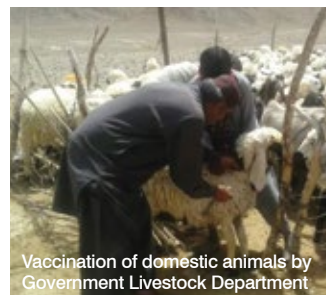
Vaccination of domestic animals by Government Livestock Department

Livestock is one of the most valuable assets for the residents of UC Abi Noughy, as it is the main source of milk and meat for their family members, as well as being a strategic coping mechanism. In the times of economic hardships and emergency, people sell their livestock to meet their financial needs. People also rear livestock and sell on the occasion of Eid-ul-Azha and earn a handsome amount to meet other domestic needs. In Balochistan, people generally keep goats and sheep. Both goats and sheep graze openly in the form of herds. So, if any animal gets infected by a communicable disease, the entire herd is affected quickly, causing reduction in milk production and loss in body weight, and even death of the animals; this leads to colossal economic losses to the community. Before the formation of the LSO Gowarikh, there was no functional system for the community to get their animals vaccinated by the Government Livestock Department. However, after the formation of the LSO, the community leaders have established a conducive relationship with the Government