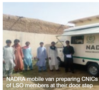
NADRA mobile van preparing CNICs of LSO members at their door step

Due to long distances, travelling to NADRA office for getting CNICs (Computerised National Identity Cards) is a time consuming and costly task for the members of the community. Therefore, the leaders decided to call NADRA mobile van to their villages. On their request, NADRA sent its mobile van to the designated villages. The LSO leaders helped the community members organise their documents in advance so the NADRA team could arrange CNICs of the people easily. So far, 310 men and women have managed to get their CNICs at their doorsteps. The initiative especially helped Persons with Disabilities (PWDs) get their CNICs as they were previously unable to visit NADRA office because of mobility issues.