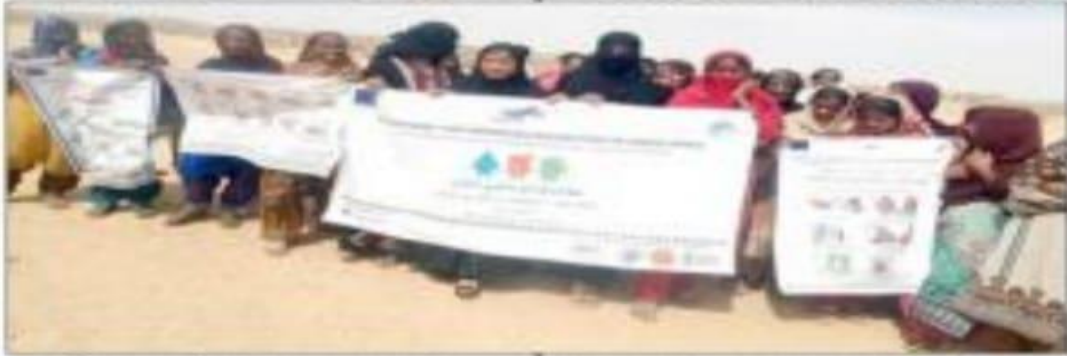
ڪراچي: هت ڏوڻ جي عالمي ڏهاڙي جي حوالي سان نڪتل ريلي جو ڏيک

ڪراچي رپورٽر سماجي تنظير ٽريڊ جيڪا | ماڻهن/ ڏسو صفحو 3 بقايا 17