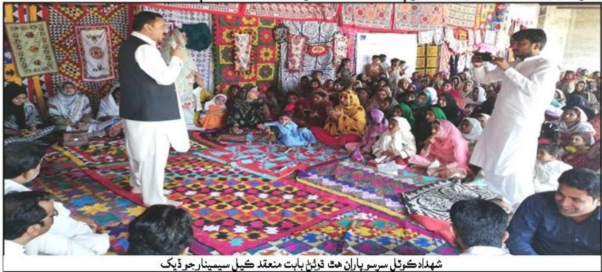
شھدادڪوٽل سروسو پاران هٿ ڌوئڻ بابت منعقد ڪيل سيمينار جو ڏيک