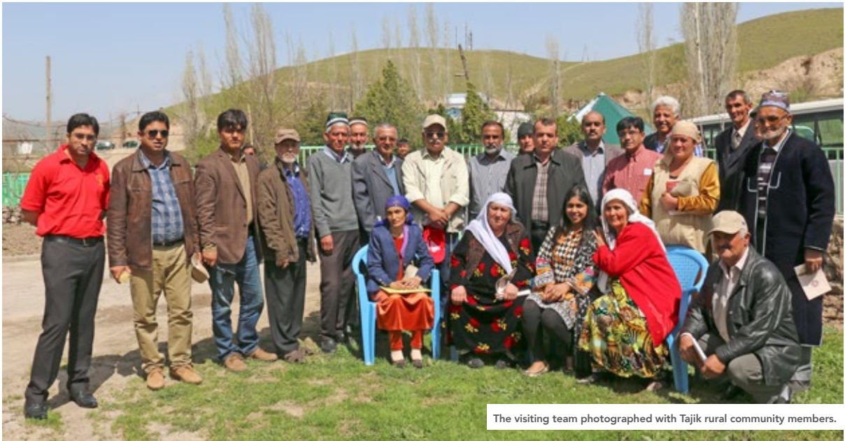
The visiting team photographed with Tajik rural community members.

The Rural Support Programmes' (RSPs) approach to community development (CDD) through social mobilisation is derived from the Pakistan's first RSP – Aga Khan Rural Support Programme (AKRSP) in Gilgit, Baltistan and Chitral. The concept was taken to Tajikistan in the 1990s and embraced by the Mountain Societies Development Support Programme (MSDSP) of the Aga Khan Foundation (AKF).