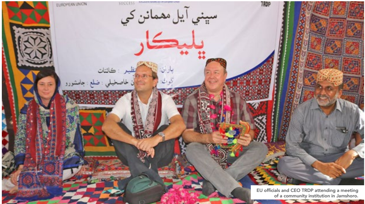
EU officials and CEO TRDP attending a meeting of a community institution in Jamshoro.