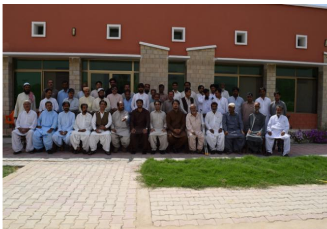
Training organized on Balochistan Public Rules, 22-23, August 2016, Khuzdar.

Furthermore, training event was organized for the participants of District Khuzdar on August 22-23, 2016.