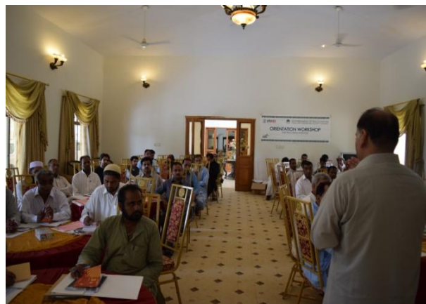
Training for officials of Lasbella, Awaran, Hub and Uthal on 25-26 August, 2016