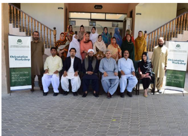
Exclusive Training organized for Female Officers of GoB on Balochistan Public Rules, 20-21, July 2016, Quetta.

A number of fifteen (15) female officers from districts of Khuzdar, Sibi, Dera Murad Jamali and Quetta participated in the training.