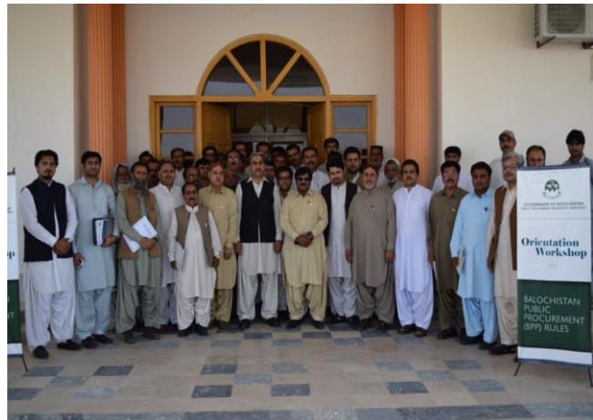
Training on Balochistan Public Rules, 18-19 April at Noshki, 2016

In addition, another training event was organized on the Balochistan procurement rules at a troubled area like Noshki on April 18-19, 2016. Encouraging participation was observed with a number of thirty four (34) participants attended the trained.