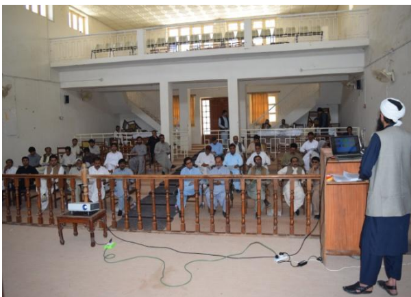
Training session on Balochistan Public Rules 18-19 April, Noshki

A total number of two hundred and seventy one (271); two fifty two (252) males and