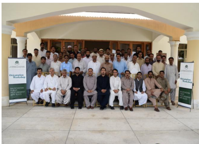
Training organized on Balochistan Public Rules, 25-26, August 2016, Lasbella.

A total number of fifty (50) participants from Lasbella, Awaran, Hub and Uthal Districts attended the training.