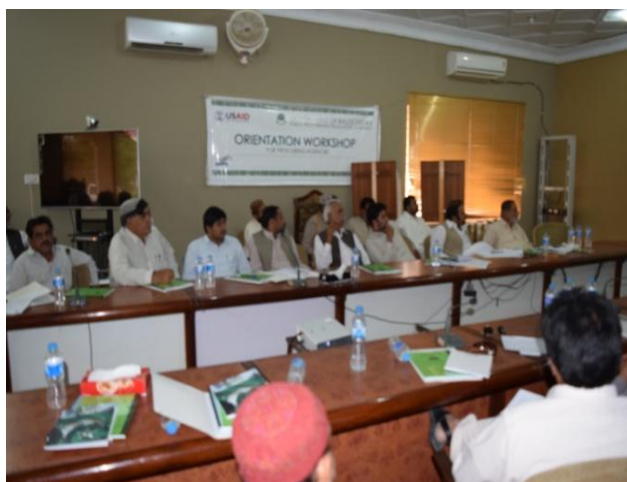
First Training on Balochistan Public Rules 2014; 28-29, March 2016, Sibi, Balochistan.

Capacity building / Training of staff is the process of enhancing the skills, capabilities and knowledge of employees for doing a particular job. Training and capacity development are intrinsic parts of human resource management system that moulds the thinking of employees and leads to quality performance of employees. It is continuous and never ending process. It is not only significant for enhancing the individual's capacity but is also vital for organizational development and success.