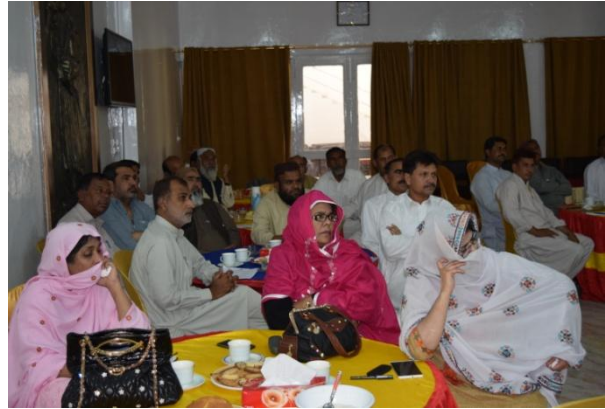
Female Participation in Training on B-PPRA Rules March 30-31, 2016 at Sibi, Balochistan