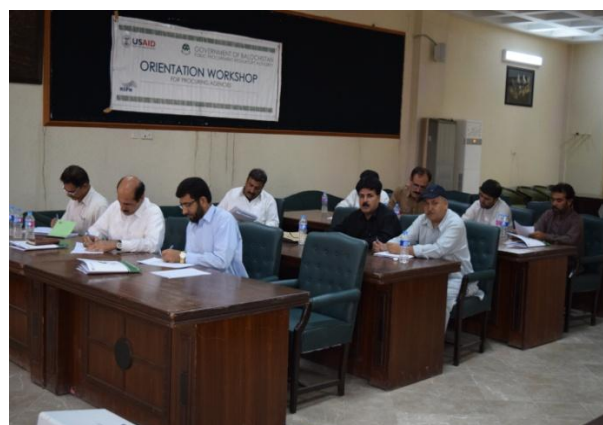
Training session on Balochistan Public Rules 18-19 April, 2016, at Noshki for officials of Mastung, Noshki and

One of the reasons for conducting eight (08) out of ten (10) training programs mentioned above as well was the loss of 1.5 month from May – June due to the pre occupation of other staff for closing of financial year and instable security situation. However, ASP-RSPN has already achieved the number of trained official i.e. two hundred and seventy