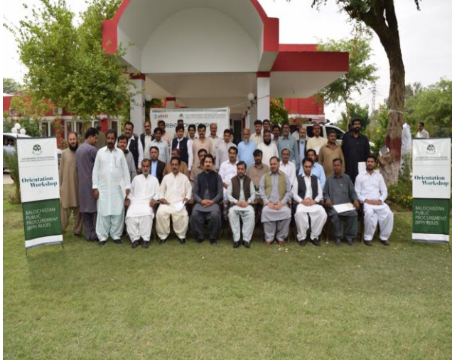
Training on Balochistan Public Rules, 30 – 31 March at Sibi, 2016

In this connection, first two training events were organized at Sibi on March 28-29, 2016 and March 30-31, 2016.