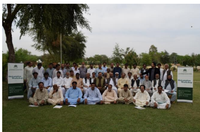
Training on Balochistan Public Rules, 28-29 March at Sibi, 2016

Balochistan Public Procurement Regulatory Authority in the second phase of Capacity building plan apart from ensuring the maximum number of participation designed the training in such a way, so that remote and hard to access areas for instance Noshki, Sibi, Khuzdar and Lasbella can also be covered. It is encouraging to note that participation in these Districts was much higher. The officials from key public sector departments participated with great eagerness in the trainings.