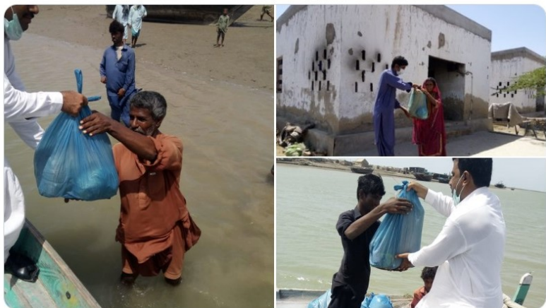
Local Support Organisations formed by the #NRSP distributed ration, bought through community philanthropy, among poor households in #Sujawal district.