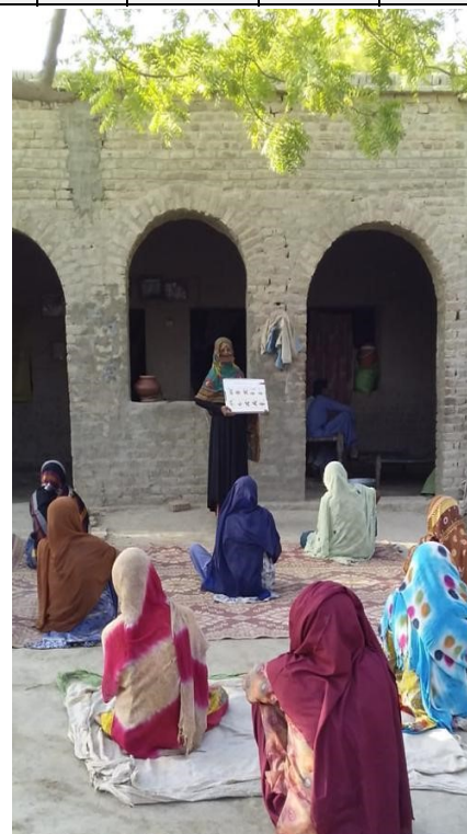
Social distancing in meetings with Community Resource Persons #CRPs under #EU funded SUCCESS Programme to raise awareness to #FightCOVID19 in UC #Gajidero of District

RSP staff and community activists are taking safety messages to communities. Critical messages of hand washing and social distancing are being conveyed. In some places, hygiene kits are being provided. Messages have gone to 33,156 Community