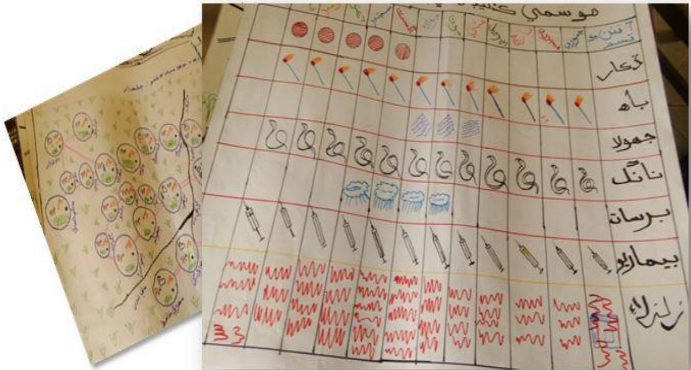
Material Developed by VDMCs