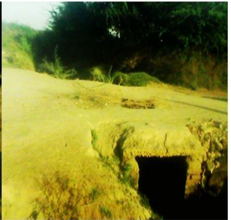
Identification of CCIs, March 2013