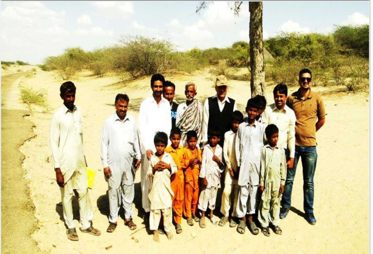
Project Manager and Monitoring officer with VDMC members in Mithi Tharparkar