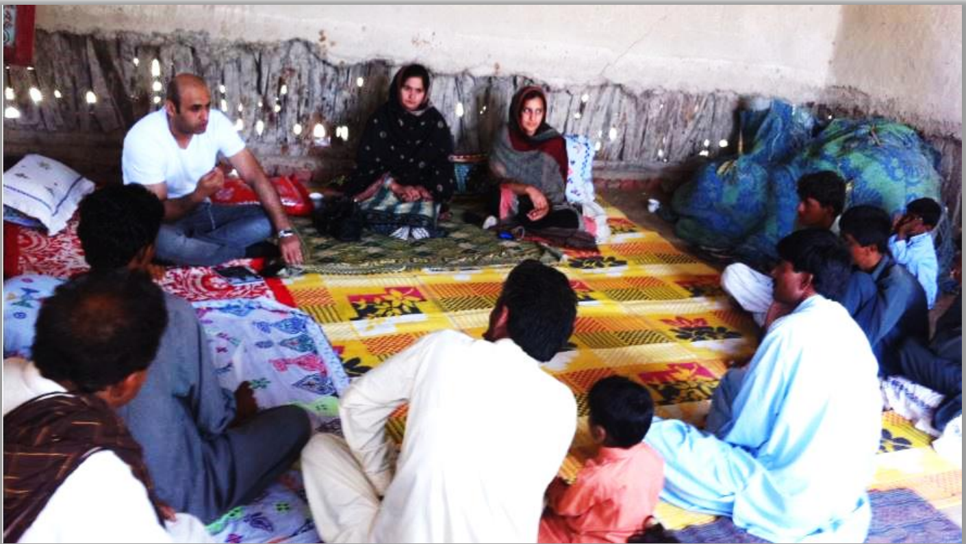
Meeting with VDMC in district Thatta, March 2013