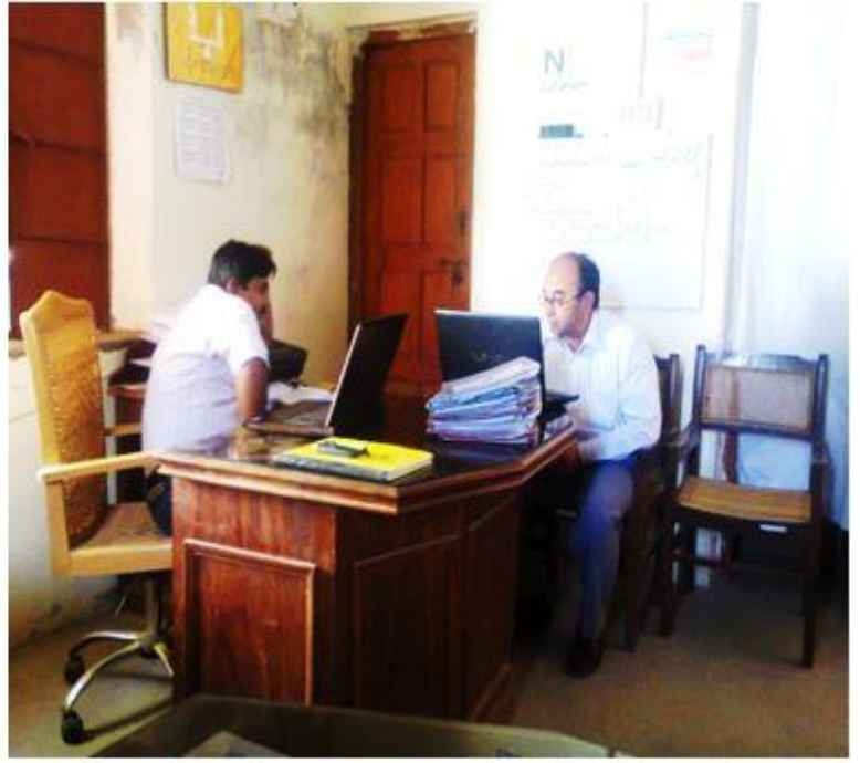
Compliance Manager visit to district Tharparkar