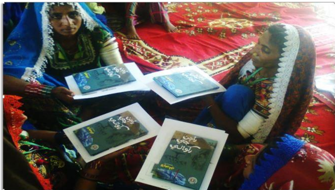
Training handouts and books provided to VDMC members, March 2013