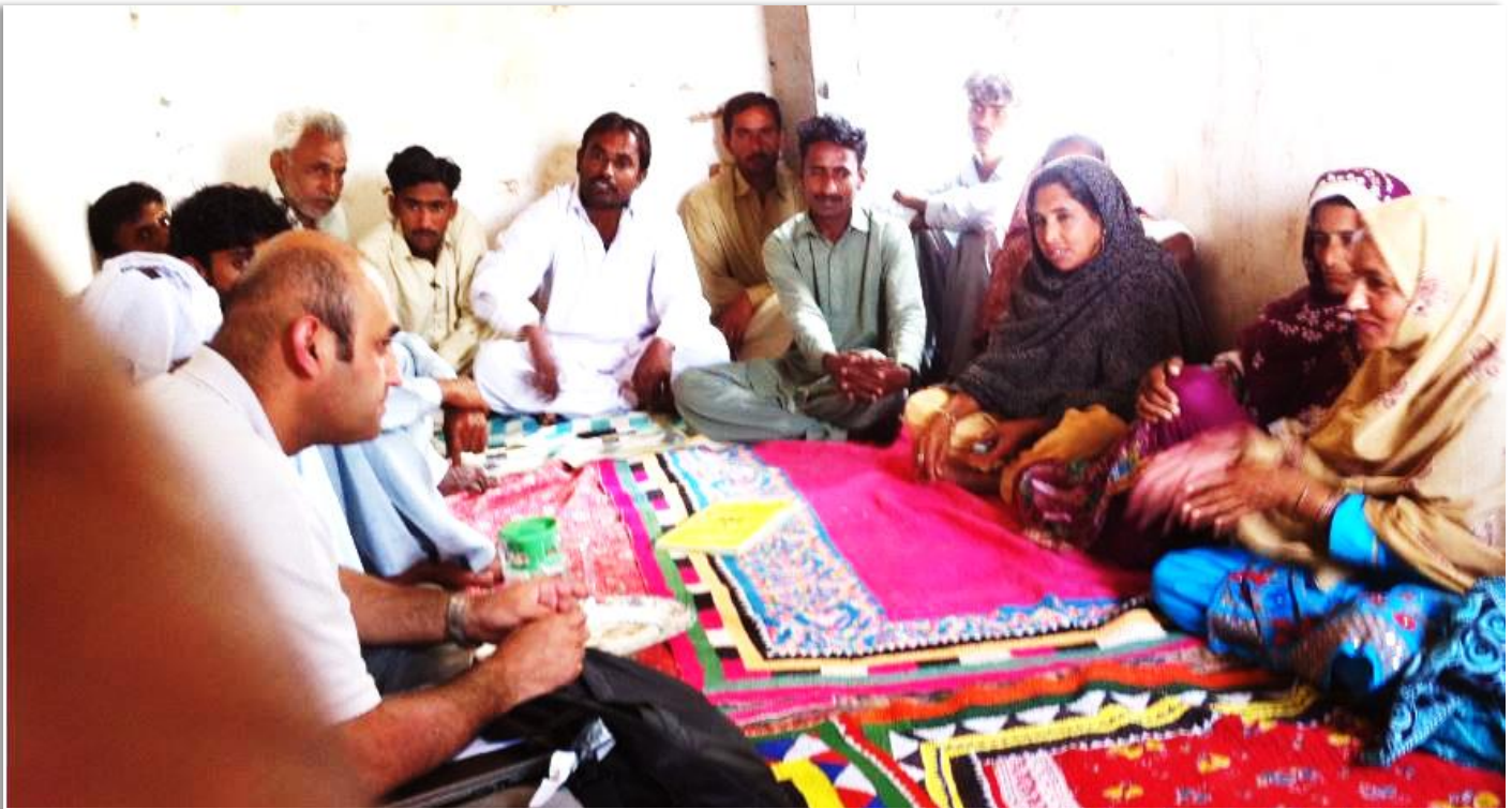
Monitoring officer in conversation with VDMC in district Badin, March 2013