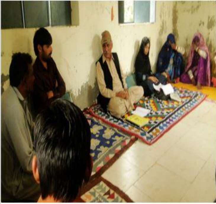
Project Manager visit to district Umerkot