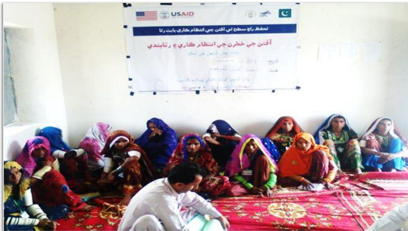
Training of VDMCs in progress