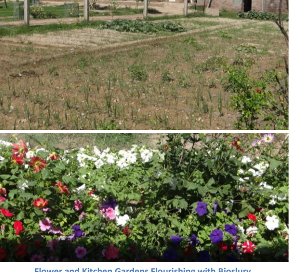
Flower and Kitchen Gardens Flourishing with Bioslury

Bioslury the plant exhausts after digestion of dung is used as an organic fertilizer in gardens of the Gurdwara. These include a kitchen garden as well. The effects of Bioslury are visible on vegetables and flower plants. Baba Bhatti says that they have been enjoying the benefits from biogas plant and encourage other people to have this facility in their homes. He used to share the multiple benefits of biogas with visitors and motivated them to contact the BCC for construction of such benefiting plant. 10 of them have contacted BCC and have constructed plants in their homes.