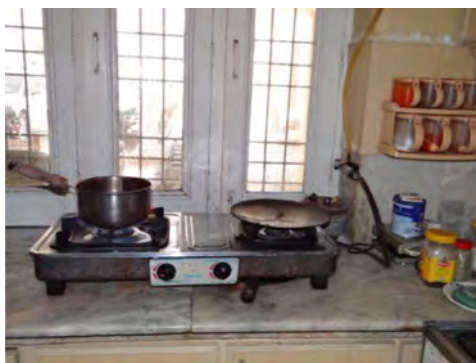
Biogas Being Used as Kitchen Fuel at Mian Irfan-ul-Haq's Home

Mian Irfan-ul-Haq's family had been using LPG cylinders as kitchen fuel. To cater the kitchen needs of the big family they used to refill the cylinders for four times in a month. So the total cost of kitchen fueling took PKRs. 7500/month. But now there is enough biogas produced that is being used as kitchen fuel by the family. They have no more worries for refilling the cylinders and consuming lots of money for the LPG. The fear of explosion of the cylinders has also vanished away. And the family especially the women are happily enjoying the facility.