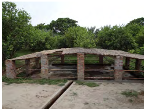
Slurry Used as Fertilizer to Enhance Growth of the Fruits

The plant exhausts enough slurry after digestion and production of Biogas. The slurry is stored in the slurry pits and later on drained to fruit plants through the irrigation channels. The slurry is best known as an organic fertilizer to balance the pH level of the arable land. Mian Irfan-ul-Haq is using this organic fertilizer in 6 acres. Thus he is saving the cost of chemical fertilizers up to PKRs 144,000/annually. He shares that the fruits of these acres are very rich in taste and nutrition and the growth of the plants is better than the other acres where the chemical fertilizers are being used.