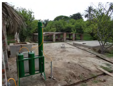
Storage Tanks & Filters Installed with Plant to Enhance its Efficiency

In December 2011 Mian Irfan-ul-Haq contacted PDBP and constructed a 15m 3 Biogas plant in his orchards availing PKRs 7000/- as subsidy from PDBP. The family started using biogas in alternate of expensive LPG cylinders. The slurry exhausted from the plant was drained to the fruit plants that put visible impact on their growth. The fruits of those plants were richer in taste and nutrition than before and the cost of chemical fertilizers also reduced because the Bioslurry was used instead. Mian Irfan-ul-Haq was happy to see the positive effects of and wished to have more slurry to fertilize maximum area in his orchards. So in