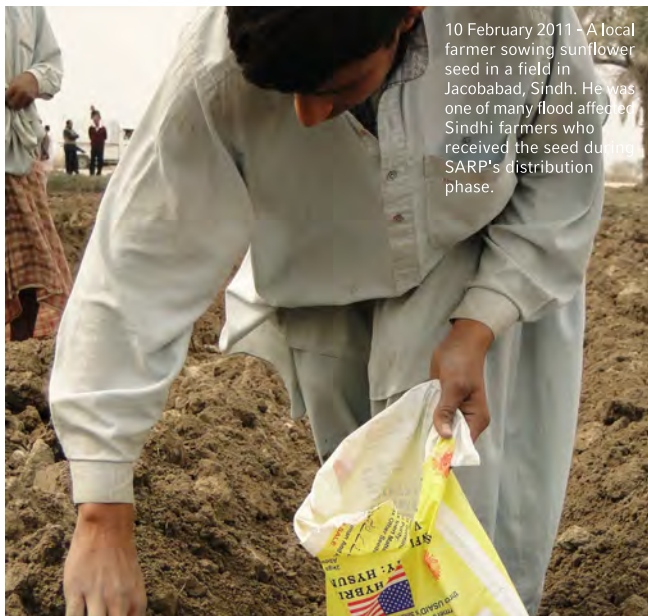
10 February 2011 - A local farmer sowing sunflower seed in a field in Jacobabad, Sindh. He was one of many flood affected Sindh farmers who received the seed during SARP's distribution phase.

2 February 2011 - RSPN's USAID funded Sindh Agriculture Recovery Project (SARP) completed its first stage, the distribution phase. Specifically during the period of January to March 2011, 50,576 beneficiaries were given inputs by SARP to cultivate sunflowers on 2 acres of land. Each beneficiary underwent training on the sowing, care and harvesting of sunflower and were handed 4kg bags of seeds, 100kg of DAP and 100kg of Urea.