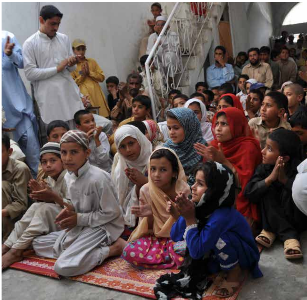
During a school sensitization drive in district Swabi

The Rural Support Programmes Network (RSPN) is the largest development network of Pakistan, with an outreach to over 30 million rural Pakistanis. It consists of 11 member Rural Support Programmes (RSPs) that espouse a common approach to rural development: social mobilisation. Social mobilisation centres around the belief that poor people have an innate potential to help themselves, that they can better manage their limited resources if they organise and are provided technical and financial support. The RSPs provide social guidance, and technical and financial assistance to the rural poor. RSPN is the strategic platform for the RSPs: it provides capacity building support to them, and assists them in policy advocacy and donor linkages.