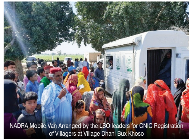
NADRA Mobile Van Arranged by the LSO leaders for CNIC Registration of Villagers at Village Dhani Bux Khoso

The government primary school in Village Pir Arthro Nawab of the Union Council (UC) Muradabad Channa had remained non-functional for two years due to the unavailability of teachers. This prohibited the children from getting a formal education, who had remained out of school during this period. After the formation of the Local Support Organisation (LSO) Umeed the LSO leaders being well aware of this concern, decided to work on appointing teachers and reopening the school. To make matters official the LSO leaders went to the DC office, explained the issue, gave an application and invited the DC to visit the school. After visiting and realising the significance of the issue, the request for school reopening was approved. Within two weeks, the teachers were appointed and the school became functional. As a result, all the children of the village enrolled back in the school, continued their education and aspire to advance their years of schooling.