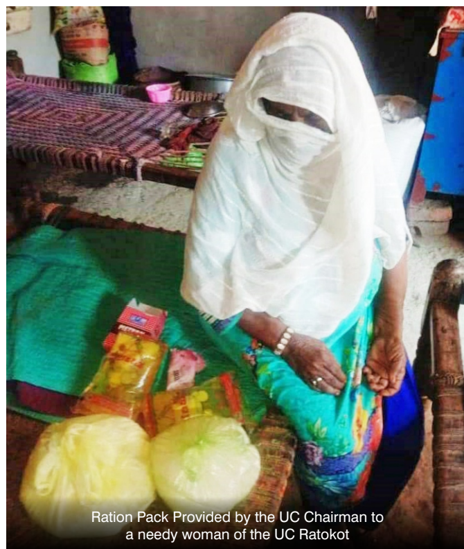
Ration Pack Provided by the UC Chairman to a needy woman of the UC Ratokot

The countrywide lockdown imposed by the government in response to the COVID-19 pandemic had left many daily wagers from Union Council (UC) Ratokot unable to find work and earn bread. Within no time, the savings of several poor households also ended and they were unable to meet their basic survival needs. Considering this issue and realising the need to act swiftly, the leaders of the Local Support Organisation (LSO) settled a meeting with the UC Chairman, for help. During the meeting, the UC chairman offered financial assistance to the LSO leaders in buying food ration packs for needy families. Through this, the LSO leaders bought 50 food ration packs, which they distributed to the 50 most deserving households in the community. This quick action was able to support many families in surviving the difficult times of the pandemic.