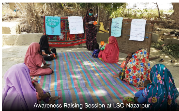
Awareness Raising Session at LSO Nazarpur

During the COVID-19 pandemic, the focus of the Government Health Department shifted away from Polio drop delivery. The District Health Officer learnt about the strength of LSOs, in terms of their active leadership and organised networks, during this state of emergency. Due to the effective coordination of the organised communities, the COVID cases were controlled in the UC and the Polio drop delivery campaign was reinstated. The community leaders and Community Resource Persons (CRPs) were invited by the Health Department to offer their support in delivering polio drops. In order to ensure the efficient implementation of the campaign, the LSO leaders pre-announced the dates of visit in the nearby villages. This also allowed the community leaders to motivate the refusal cases, beforehand, to allow their children to receive Polio drops. The campaign was regularly monitored, and the missing children were reported to the Polio teams so that they could receive the vaccine during the follow-up visits. This dedicated effort of the community leaders has resulted in vaccination of almost 100% children in UC Nazarpur.