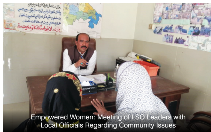
Empowered Women: Meeting of LSO Leaders with Local Officials Regarding Community Issues