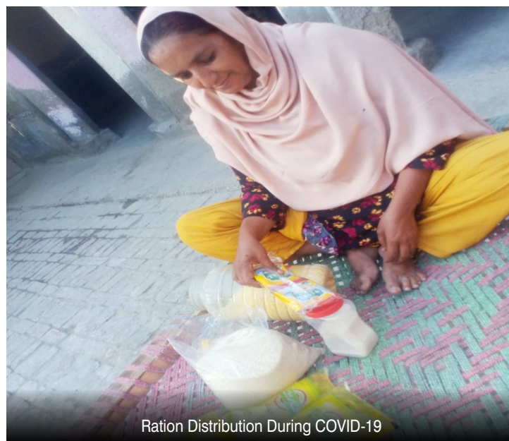
Ration Distribution During COVID-19