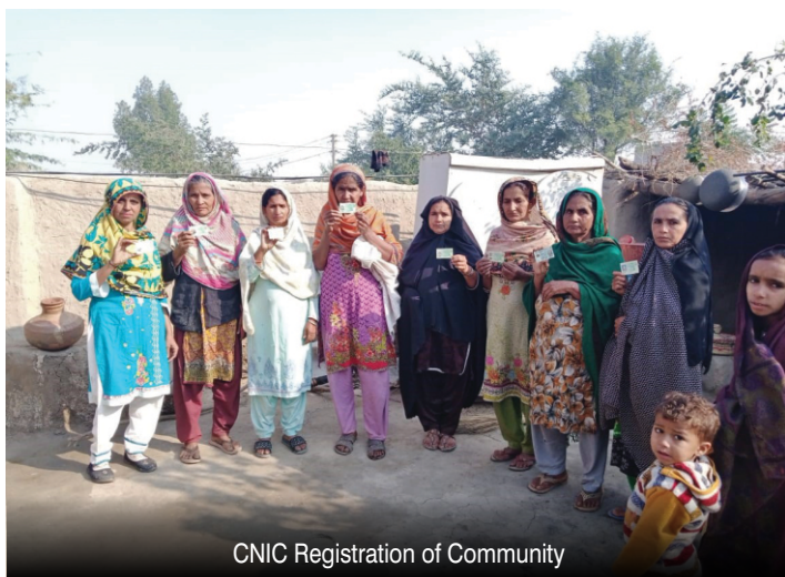
CNIC Registration of Community

highlighted the vulnerable and defenceless condition of the community against COVID-19. Through these efforts of LSO, local philanthropists and community notables distributed ration of PKR 10,000 among 56 poorest households. Furthermore, the district authorities provided ration to 65 poor households who could not make an earning during the lockdown. The provision of essential items such as soaps, masks, and hand sanitizers has also been ensured during the pandemic.