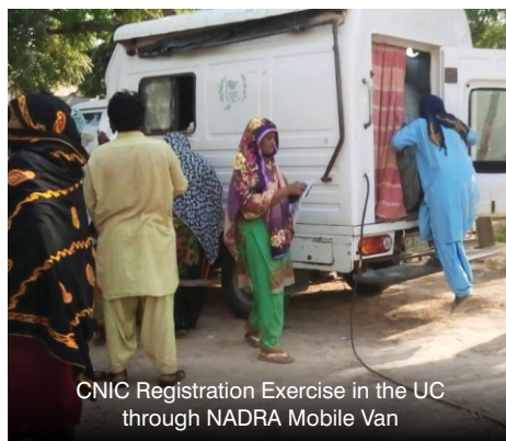
CNIC Registration Exercise in the UC through NADRA Mobile Van