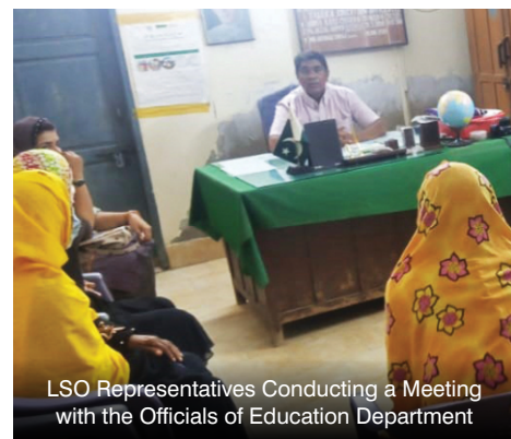
LSO Representatives Conducting a Meeting with the Officials of Education Department