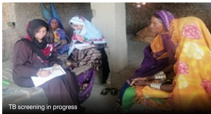
TB screening in progress

Pakistan, with an estimated 510,000 new TB cases emerging each year and approximately 15,000 drug-resistant TB cases every year, is ranked fifth among the high-burden countries worldwide. Therefore, to identify the TB cases, the LSO leaders conducted screening of the community individuals at the household level. This screening activity was facilitated by Community Health Solution (CHS) funded project Zindagi Naimat Hey, implemented by NRSP. A total of 1,100 individuals were screened in the UC by the CRPs, out of these, 93 individuals were found with TB symptoms. These patients with symptoms were provided tokens for treatment and referred to the CHS TB Centre for free treatment.