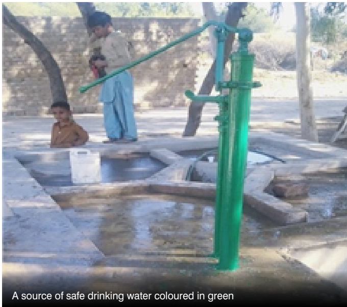
A source of safe drinking water coloured in green

Disease-causing germs and chemicals can find their way into water supplies. The water which people drink and use for other purposes must be clean and safe. Therefore, testing the sources of drinking water and informing the community members about clean and polluted water sources significantly improve their health status.