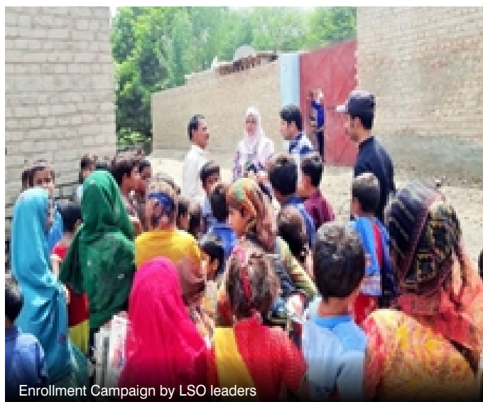
Enrollment Campaign by LSO leaders

Many school-aged girls and boys are out of school in the UC. Some of the main reasons for out-of-school children included poverty, access issues, illiterate parents, poor quality of education, and teachers' attitudes. The women leaders of LSO Masoo Bozdar are therefore working to improve school enrolment and resolve other education-related issues in their UC. With the support of the