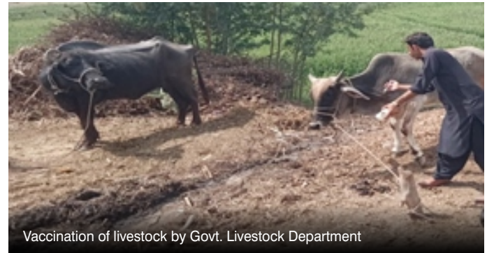
Vaccination of livestock by Govt. Livestock Department

widespread communicable diseases, the production of livestock has suffered heavily, and sometimes the animals die, causing huge losses to the poor families. When a Community Livestock Extension Worker (CLEW) was trained under the EU-Funded PINS ER3 Programme, he created awareness among the LSO leaders about the vaccination of animals. Motivated by his ideas, the LSO leaders approached the Government Livestock Department and requested for vaccination of their animals. On the advice of the LSO leaders, the concerned VO leaders provided needful support to the Livestock Department staff, and they started vaccination of their animals. So far, they have vaccinated 1,175 animals, including 621 buffalos and cows and 554 goats and sheep. It is expected that the vaccination will prove instrumental in controlling the communicable viral diseases in animals and consequently will save the economic losses of the beneficiary families.