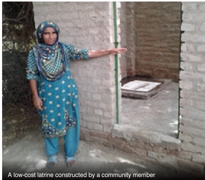
A low-cost latrine constructed by a community member

and benefits of adopting proper sanitation practices through CAT sessions during the CO meetings and motivated them to take action on a self-help basis. The LSO with support of the WISE programme, conducted village cleaning campaigns in 27 villages. As a result of the campaigns, 11 villages have now become clean. The village cleaning process will continue till all villages are cleaned. To place a proper solid waste mechanism in the UC, the LSO members constructed mud-made dustbins at the household level on a self-help basis which they call "Kachra Kundhi" in the local language. So far, a total of 76 dustbins have been constructed in the UC. In addition to that, 15 plastic dustbins have also been installed at the prominent sites in the UC identified by the LSO leaders with the financial support of the WISE project. The organised rural women also involved themselves in latrine construction to mitigate the issue of open defecation. On their motivation, 342 poor families who defecated openly, constructed low-cost latrines on a self-help basis. The sanitation activity is still going on, and the LSO leaders are trying to clean all villages and settlements in the UC and transforming them into open defecation free areas as soon as possible.