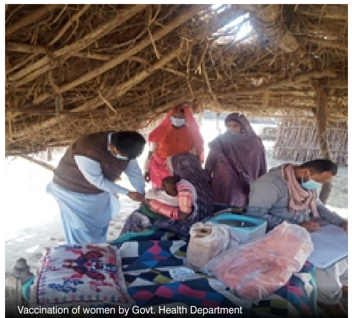
Vaccination of women by Govt. Health Department

Since June 2019, the LSO is also working with the NRSP core-funded WISE programme. The WISE programme has been integrated with the SUCCESS programme's CAT sessions, and the CRPs are delivering sessions to create awareness about the benefits of immunisation in the community. As a result of these LSO efforts, 84% of children aged 0-11 months completed the vaccine till PENTAVALENT III, while 76% of children aged 12-23 months completed the Measles II vaccination. Apart from this, 50% of pregnant women aged between 15-49 years completed the TT-II vaccine across the UC.