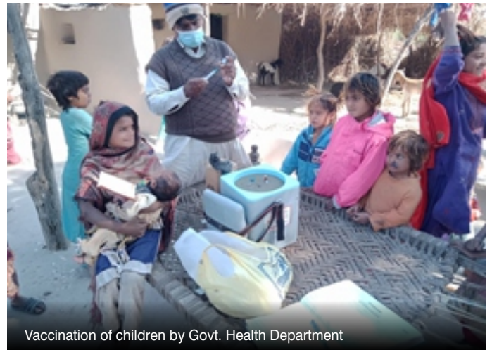
Vaccination of children by Govt. Health Department

The women LSO leaders actively supported the Government Health Department in the effective launch of routine immunisation campaigns at the UC level. On the advice of the LSO leaders, the CRPs and VO leaders helped the vaccinators, LHWs, and Polio teams in the immunisation programmes. They also convinced those families who were resisting vaccination of their children due to illogical myths and suspicion. They also identified the children missed in the vaccination campaigns and provided their list to the concerned Health Department staff, and they vaccinated them during their follow up visits.