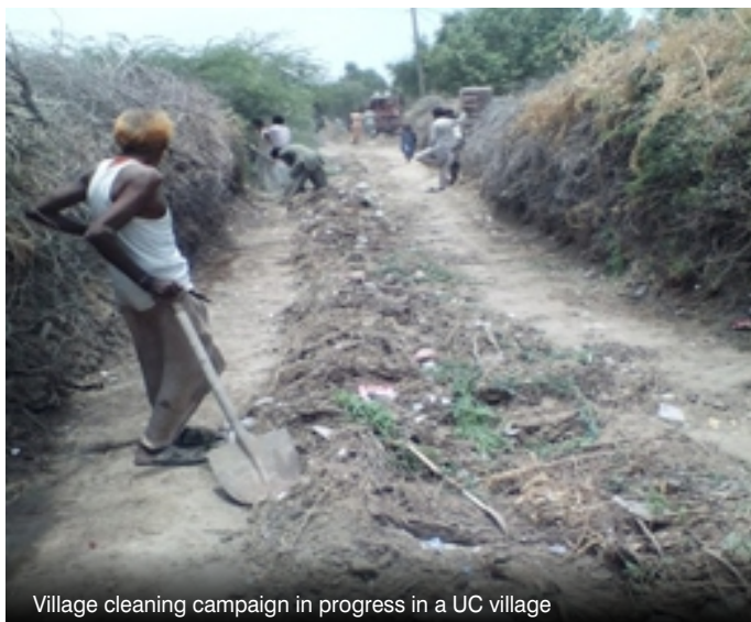
Village cleaning campaign in progress in a UC village

Before they were organised, the community members of LSO Masoo Bozdar were facing similar problems. After organising in COs, VOs, and LSO under the EU-funded SUCCESS Programme, they discussed their common issues and prioritised them under their development plans. The sanitation issue was raised as one of the priority issues and they decided to resolve them. The LSO leaders, in collaboration with NRSP's core-funded Water, Immunisation, Sanitation, and Education (WISE) programme trained the CRPs on conducting awareness sessions on sanitation. The CRPs raised the awareness of communities on the importance