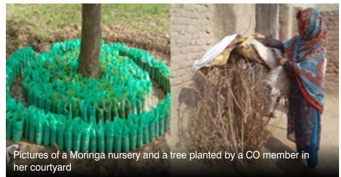
Pictures of a Moringa nursery and a tree planted by a CO member in her courtyard

Sensitised by the CAT session on the benefits of tree plantation, the LSO leaders decided to plant trees at a large scale throughout their UC. On the instruction of the LSO leaders, the Village Organisation (VO) leaders raised awareness among their member COs about the benefits and importance of tree plantation and created effective demand for planting materials, and submitted the demands for tree saplings to the LSO leaders. The LSO leaders then approached the Government Forest Department for the provision of rooted trees for onward distribution among CO members through VOs. The LSO leaders bought 1,000 saplings at subsidised rates from the Forest Department and distributed them among CO members who planted them in their courtyards and other free spaces near their houses. The Agriculture Entrepreneurs trained and supported by the EU-funded PINS ER3 Programme sold 250 Moringa tree saplings on subsidised rates and the LSO purchased 100 trees on a self-help basis and distributed them amongst the CO members. Thus, a total of 1,350 trees have been planted in the UC. The process continues and the LSO and VO leaders are planning to plant more trees in the future.