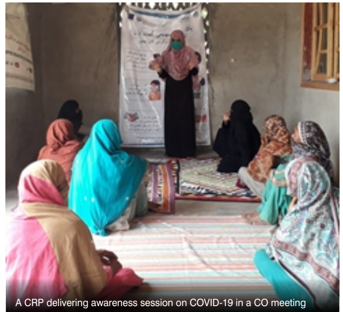
A CRP delivering awareness session on COVID-19 in a CO meeting

eyes, nose, or mouth without first washing hands, stay home, avoid large gatherings, and keep a distance of at least 6 feet when in the company of others, and wear a face mask if sick with cold/ flu-like symptoms or when outside the home in an area with others. Since the outbreak of the COVID-19 Pandemic to date, 10 CRPs of the LSO have conducted 124 sessions in all 48 COs. To further proliferate the information regarding the COVID-19 pandemic among the communities, the women LSO leaders, in collaboration with VO and CO leaders are making announcements from local mosques in all villages. The COVID-19 awareness continues in the union council through the network of CO/VO/LSO and CRPs.