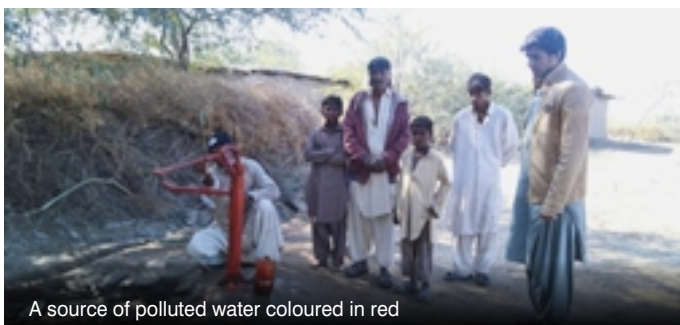
A source of polluted water coloured in red

The LSO Masoo Bozdar did not know about the safety of the drinking water sources in their villages. The NRSP core-funded Water, Immunization, Sanitation, and Education (WISE) programme educated the LSO leaders about this important issue, and offered them to launch a collaborative programme on WISE. With the technical support of NRSP, the LSO leaders identified 38 communal water sources through their CRPs. After identification of these communal water sources, the LSO leaders tested these water sources from PCRWR and found that 28 water sources are clean while 10 are polluted and unfit for human consumption. The LSO painted the safe sources of water with green and unsafe ones with red colours. The CRPs conducted continuous sessions on the importance of using safe drinking water and avoiding using water from polluted sources. As a result of these awareness sessions, the effective demand for safe drinking water rose very high in the LSO members and they approached external sources for installation of hand pumps in areas where the water sources were clean. As a