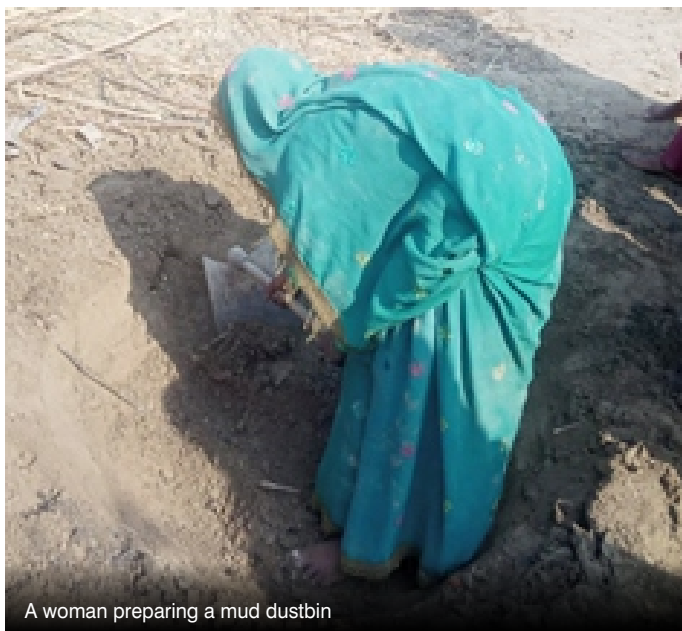
A woman preparing a mud dustbin

Sanitation and solid waste management is an ignored chapter of the poor rural communities of Pakistan, especially in Sindh. The people in villages are adopting the traditional methods for sanitation and solid waste management in rural areas because there is no proper sanitation and solid waste disposed/management mechanism exists at the household or village level. Mostly, villages are found with heaps of animal dung and other waste. People throw the waste of their homes in front of their own houses without sorting it, which slowly get converted into heaps. When the wind blows, the same waste spreads in the village which has hazardous impacts on the lives of the villagers. Open defecation in villages is another serious issue for the villagers. Research suggests that diarrhoea and other problems associated with ingesting and exposure to human waste affect children under the age of 5 years the most since they are very susceptible to diseases.