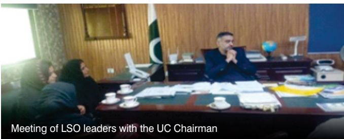
Meeting of LSO leaders with the UC Chairman

The unavailability of clean and fresh drinking water was a big problem in the villages of Mahi Darban of UC Yarodero. When the women-led Local Support Organisation was formed, the issue was raised during the meetings as a priority need of the area. The leaders of the LSO decided to approach their UC Chairman for support. They briefed the UC Chairman about the water issues and requested support in the installation of additional pipes at various locations of the four villages. The UC chairman was impressed to see how organised and confident the women leaders of the LSO were, not only in identifying their needs but also in developing a practical plan for resolution. He assured the LSO leaders his full support and submitted their plan for approval with the district government. They surveyed the villages and identified suitable locations for the installation of additional water supply pipes. Within a few days, the UC Chairman informed the LSO leaders that their plan was approved but unfortunately its physical work is delayed due to COVID-19 pandemic.