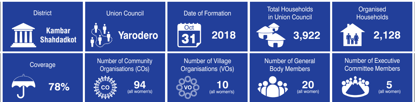
(LSO Profile as of July 31, 2020)

LSO Ekta Kamiyabi from District Kamber-Shahdadkot was formed on 31st October 2018 by 2,128 member households organised into 94 COs and 10 VOs. The women leaders of LSO Ekta Kamiyabi are planning and implementing development activities both on a self-help basis as well as in collaboration with government agencies. The EU-funded SUCCESS programme is empowering rural women in Sindh through realising the power they gain from collective action. Organised women are now gaining awareness about their rights, holding the service providers accountable, and also taking initiatives to improve their lives.