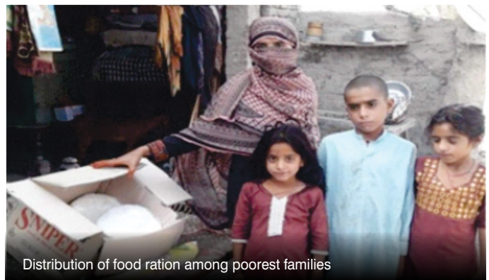
Distribution of food ration among poorest families

During the COVID-19 lockdown period, poor people were facing a financial and economic crisis because they had lost their sources of income. The women leaders of LSO Ekta Kamiyabi decided to support the poorest households who were unable to arrange bread and butter for themselves. LSO leaders went to meet the UC Chairman and briefed him about the issue, submitting the list of needy households to him. With the support of the local government, 25 needy households received food ration. Thus the families of these poorest families were saved from food crisis.