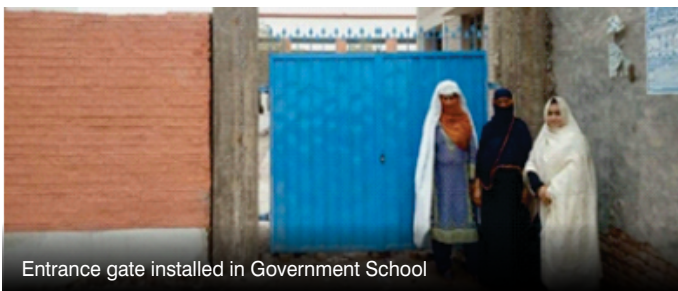
Entrance gate installed in Government School

There is a Government primary school in village Jaffrani. Due to the absence of the main entrance gate, the school's furniture was stolen. It had caused a serious problem for the students and teachers of the school and ultimately, it hindered the education of the children. When the women leaders of LSO Ekta Kamiyabi, fostered under the EU funded SUCCESS Programme, learnt about it, they formed a committee comprised of five members including the President, Manager, Treasurer and two General Body members on 4th February 2020 in consultation with the members of the relevant Village Organisation. This Committee went to the Deputy Commissioner's (DC) office and briefed him regarding the issue and requested for the installation of an entrance gate in the school. The DC appreciated the efforts of the LSO leaders for raising the issue and assured them that the issue will be resolved as early as possible. With the directions of the DC, the entrance gate of the school was installed. The school is now a safer place for students.