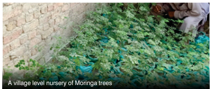
A village level nursery of Moringa trees