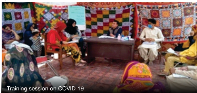
Training session on COVID-19