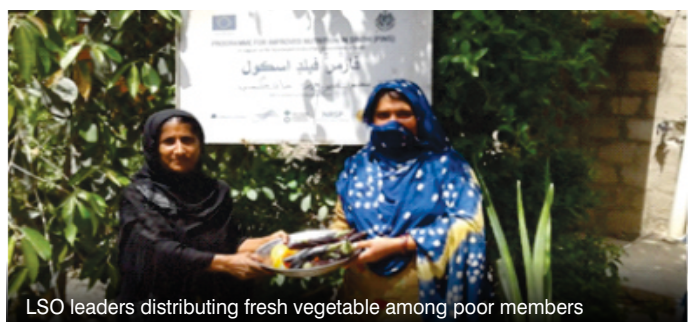
LSO leaders distributing fresh vegetable among poor members

During the lockdown period to contain the spread of the COVID-19 pandemic, food items, specifically fresh vegetables, were hard to access by the community members. Prices had risen and it was nearly impossible for poor households to buy sufficient food, leading to starvation and a nutrition crisis at the household level. In LSO Ekta Kamiyabi, agriculture