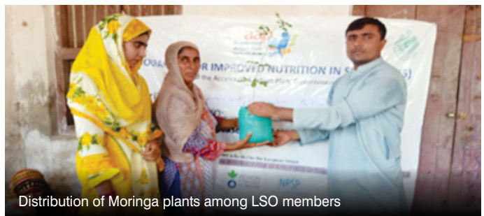
Distribution of Moringa plants among LSO members

LSO leaders conducted a meeting with Agriculture Entrepreneurs (AEs) under PINS ER 3 and highlighted the need for Moringa plantation at the community level. Moringa nurseries are being developed at the VO level via allocated Farmer Field Schools (FFS). Every FFS planted and grew 700 Moringa saplings. In a single Union Council, 4,900 plants are grown by AEs. With the support and facilitation of LSO leaders, 700 Moringa plants were distributed among eligible FFS members in VOs. The VO leaders distributed the trees among CO members who planted them in their courtyards and other free spaces around their homes. Once grown, these Moringa trees will improve the nutrition status of the concerned families significantly.