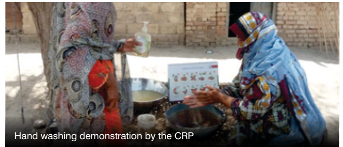
Hand washing demonstration by the CRP

The LSO leaders then conducted a meeting with the Community Resource Persons (CRPs) of WASH under the EU funded Programme for Improved Nutrition in Sindh (PINS-ER3) and unanimously decided that the CRPs will provide awareness sessions on COVID-19 along with handwashing demonstration activities. The CRPs conducted 200 awareness sessions in all VOs and 70 COs of the LSO. All these sessions were facilitated and arranged by the VO and CO leaders of the LSO.