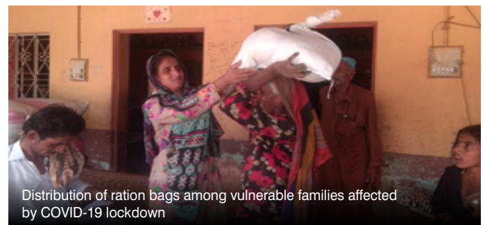
Distribution of ration bags among vulnerable families affected by COVID-19 lockdown

sessions in the COs. Following the guidelines of the Government of Sindh, the CRPs ensure a distance of six feet among the participants during the CO meetings. After delivering the scheduled CAT sessions, the CRPs educate the participants about preventive measures against the spread of COVID-19. So far, CRPs have conducted such sessions in 61 Cos.