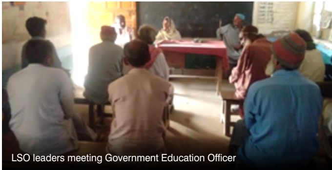
LSO leaders meeting Government Education Officer

The building of Government Primary School goth Memon Gi Wasi was damaged and required immediate repair, however, nobody in the Government was taking notice of it. The LSO leaders, therefore, highlighted the issue of the damaged school building through different media channels, and as a result, the Government Education and Public Works and Services Departments repaired the school building. The LSO leaders are also making efforts to increase the enrolment of children in schools in collaboration with the Government Education Department. As a result of their coordinated efforts, 60 girls and boys have been enrolled in different schools; out of these, 10 girls are enrolled in the High School for continuing their further education.