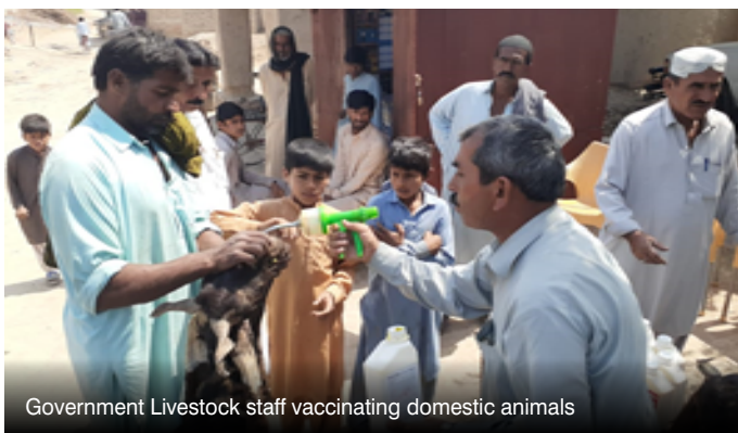
Government Livestock staff vaccinating domestic animals

The Community Resource Persons (CRPs) provide awareness to the community members on the importance and benefits of vaccination of their domestic livestock, which is a valuable asset for their livelihood. Hence, there was a demand for vaccination of animals within the community members. The LSO coordinated with the Government Livestock Department for the vaccination of livestock in their UC. As a result, the livestock department vaccinated 575 animals across the UC. The vaccination will prevent the spread of communicable diseases among the animals and the farmers will get maximum output from the healthy animals.