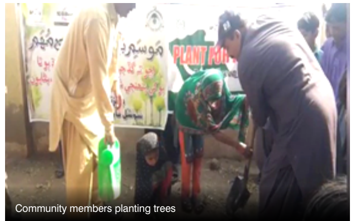
Community members planting trees

Trees are valuable assets for rural people as they provide shade in hot weather, fodder for domestic animals, and clean pollution from the air. The LSO leaders coordinated with the Government of Sindh in the tree plantation campaign. On the request of the LSO leaders, the Assistant Commissioner of Matiari provided 250 rooted saplings free of cost from the Forest Department. The LSO distributed these saplings among its VOs, who gave them to interested people in their member COs for planting in their courtyards and other free spaces around their homes. The LSO members are committed to planting more trees in the future.