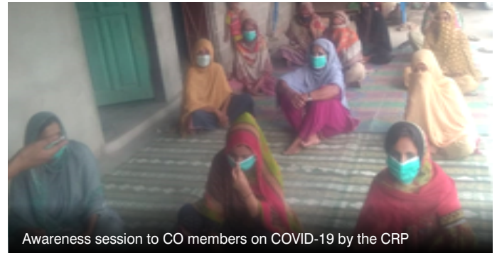
Awareness session to CO members on COVID-19 by the CRP

LSO Matiari, from District Matiari, was formed on 22nd December 2017, by 2,319 member households organised into 115 COs and 8 VOs. Women leaders of LSO Matiari are planning and implementing development activities both on a self-help basis as well as in collaboration with government agencies. The EU-funded SUCCESS programme is empowering rural women in Sindh through realising the power they gain from collective action. Organised women are now gaining awareness about their rights, making the service providers accountable, and also taking initiatives to improve their lives.