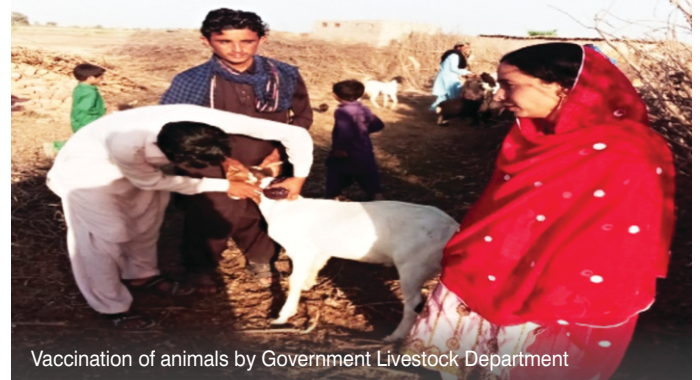
Vaccination of animals by Government Livestock Department