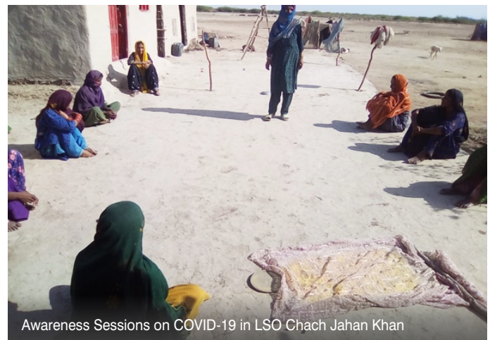
Awareness Sessions on COVID-19 in LSO Chach Jahan Khan

The organised communities in the form of COs, VOs and LSOs under the EU funded SUCCESS programme are also trying their best to combat the pandemic at local level. The women leaders of LSO Chach Jahan Khan have undertaken several activities in this regard. The women Community Resource Persons (CRPs) are