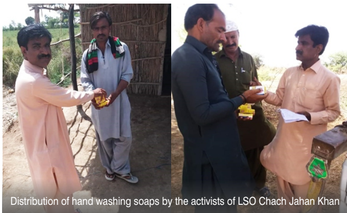
Distribution of hand washing soaps by the activists of LSO Chach Jahan Khan

In addition, the LSO leaders have distributed 5,400 hand washing soaps among their members. They first collected funds from members for purchasing soaps, while also distributing 1,000 soaps with their own funds. They then approached the UC chairman for support, who provided 4,400 hand washing soaps which they distributed among their members. The soaps were distributed among some 2,450 families according to their family size, i.e. more soaps in households with larger family members.