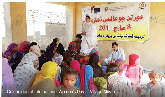
Celebration of International Women's Day at Village Miyani

The LSO organised rallies at both villages. They displayed banners highlighting messages on women's rights and chanted slogans in favour of women's empowerment. The rallies then converted into gatherings, where the President, General Secretary and Treasurer of the LSO made speeches on the importance and benefits of celebrating International Women's Day. The local UC Counsellor also attended the celebrations and offered his support in arranging the celebrations in every village of the UC next year. The Taluka Incharge and Social Oragniser (SO) of Thardeep Rural Development Programme (TRDP) also attended the celebrations and appreciated the efforts of the LSO leaders.