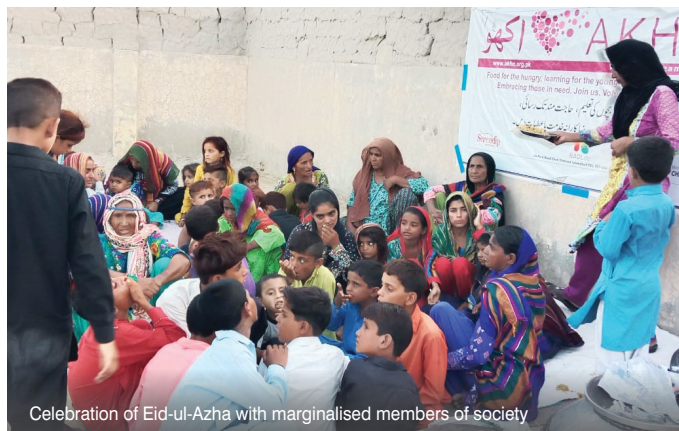
Celebration of Eid-ul-Azha with marginalised members of society

The LSO leaders identified marginalised members of the community in four villages of UC Bubak. On Eid-ul-Azha, the AKHU staff served food to over 300 people.