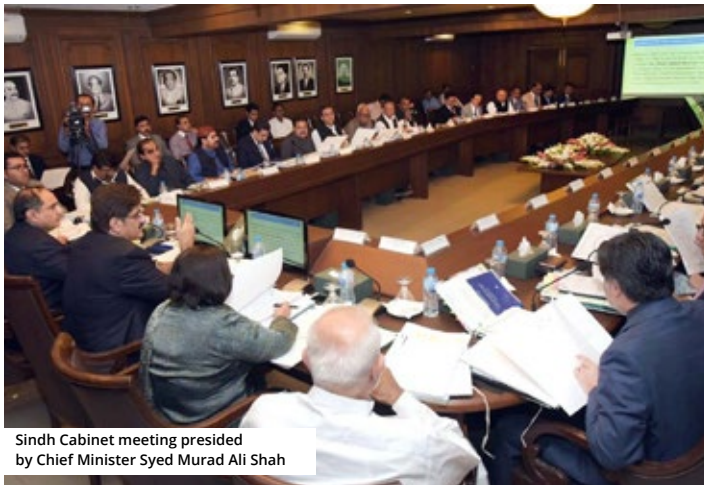
Sindh Cabinet meeting presided by Chief Minister Syed Murad Ali Shah

The Sindh Cabinet formally approved and adopted the Poverty Reduction Strategy (PRS), which was developed with technical support from the European Union funded SUCCESS programme. The cabinet members, under the leadership of Chief Minister Murad Ali Shah agreed upon a proposed budget of PKR 72.5 billion for