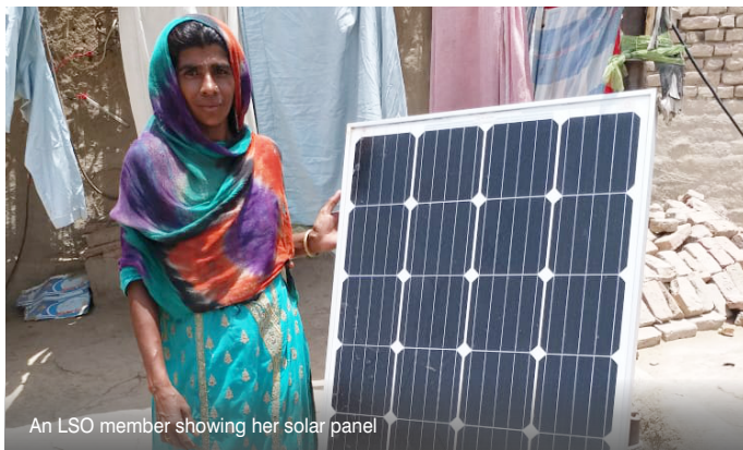
An LSO member showing her solar panel