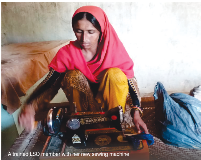
A trained LSO member with her new sewing machine

Another demand raised by the members was provision of sewing machines to the trained women in stitching and sewing. On the