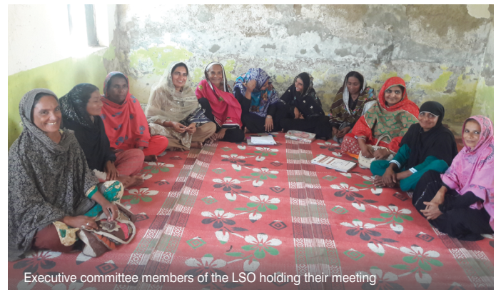
Executive committee members of the LSO holding their meeting

A large number of families living in UC Shahmeer Rahu have no proper access to safe drinking water. The only available source of safe drinking water is underground water that is accessed using hand pumps. Underprivileged families cannot afford the cost of hand pump material and installation charges. Therefore, they have had to request drinking water from owners of the hand pumps on a daily basis.