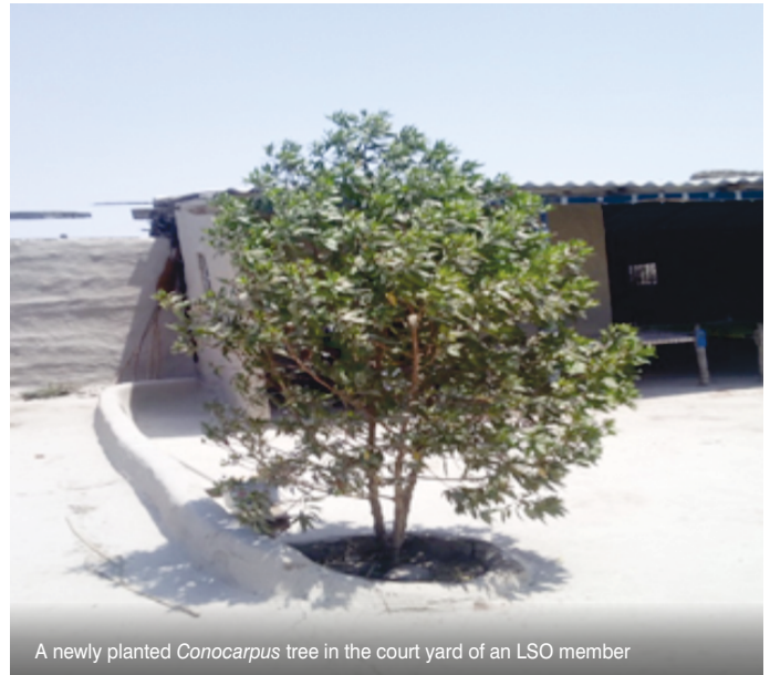
A newly planted Conocarpus tree in the courtyard of an LSO member

Situated in a coastal region, UC Marho Bola Khan has saline soil that does not support tree growth. After the formation of the LSO, they learnt that there are certain tree species which grow well in the saline soils. They purchased 570 rooted Conocarpus plants from the Sindh Forest Department as well as from private nurseries and distributed among their CO members who have planted them in their courtyards. According to the LSO leaders "These trees grow very fast. They provide us shade in summer and fuel wood in winter".