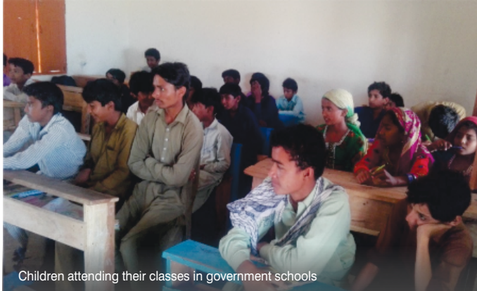
Children attending their classes in government schools

The LSO first conducted a door to door survey to identify out of school children with the help of its VO and CO leaders. The CO leaders then motivated their members to send their children to schools by making them realise the strategic importance of education during the meetings. The CO leaders conducted follow up visits of their houses and ensured that the children are enrolled in schools. 1,200 children have been enrolled through the efforts of Community Institutions leaders. According to the LSO leaders "Majority of out of school children are now enrolled in government schools. Only around 60 families are not sending their children to schools, because these children are responsible for their domestic animals. However, as access to grants and funds through SUCCESS programme increases, these children will be enrolled".