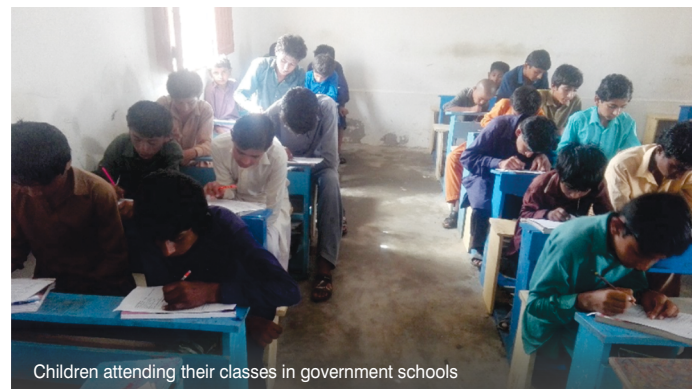
Children attending their classes in government schools

Despite the availability of government schools in Union Council Marho Bola Khan, a large number of school aged boys and girls were out of school. The main reason was parents' unwillingness as they lacked the understanding of the importance of education. The women leaders of LSO Marho Bola Khan understood these facts when they attended awareness sessions conducted by the Community Resource Persons (CRPs) under the EU funded