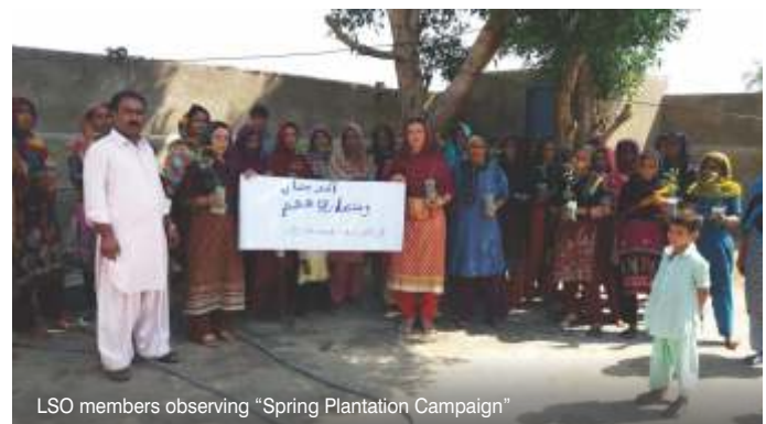
LSO members observing "Spring Plantation Campaign"

In the past, there was no tradition of planting forest trees in the Union Council (UC). Only a few families had forest trees in their courtyards for shade. The main reason for the lack of trees was that people of the area were not aware of the importance of forest trees in improving the environment, providing shade in summer and fire wood in winters. After mobilising community women into COs, VOs and the LSO, they learnt about the importance of forest trees from