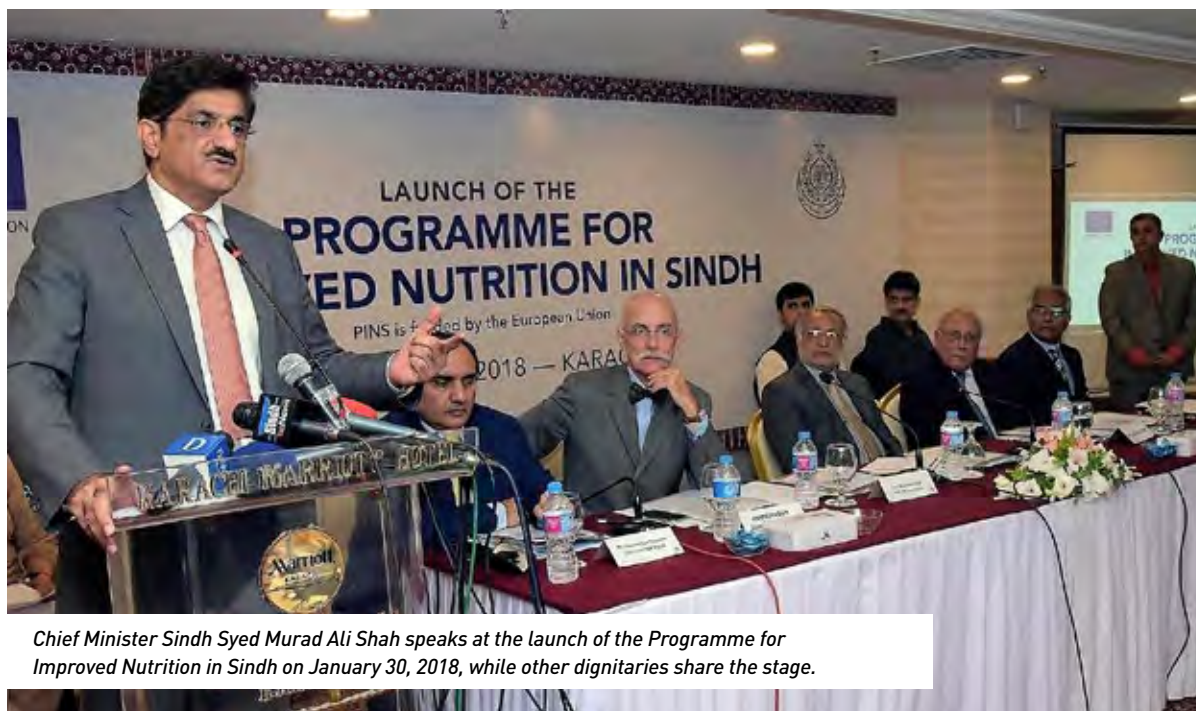
Chief Minister Sindh Syed Murad Ali Shah speaks at the launch of the Programme for Improved Nutrition in Sindh on January 30, 2018, while other dignitaries share the stage.

The Chief Minister of Sindh Syed Murad Ali Shah launched the European Union's (EU) funded Programme for Improved Nutrition in Sindh (PINS) in a ceremony arranged on January 30 in Karachi. Initiated in close collaboration with the Government of Sindh's multi-sectoral Accelerated Action Plan for Reduction of Stunting and Malnutrition (AAP), the Programme's primary focus is to sustainably improve the nutritional status of children under five years and of pregnant and lactating women (PLW). PINS will be implemented in ten districts of Sindh, i.e. Shikarpur, Thatta, Kambar Shahdadkot, Larkana, Dadu, Jamshoro, Matiari, Sajawal, Tando Allahyar and Tando Muhammad Khan.