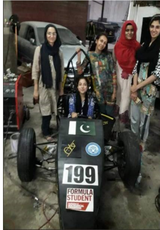
Female students of NUST with their Formula car developed to compete in England in July.

Formula Student - Europe's most established educational engineering competition - is backed by high profile engineers and global industries. Each year hundreds of competitors take on the challenge of producing a prototype single-seat racing car for sprint racing or autocross. The finished vehicle is presented to a manufacturing firm for technical evaluation. The NUST team's car can go from 0-100 kilometers per hour in just 4.5 seconds and has 90 horsepower engine and will compete against 30 cars from around the world.