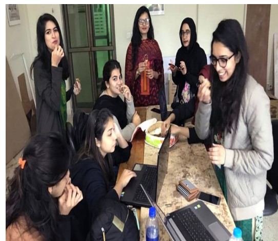
The All - Girls team of Formula Car at NUST working in their lab.