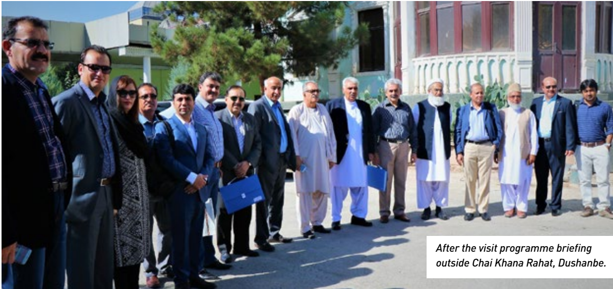
After the visit programme briefing outside Chai Khana Rahat, Dushanbe.

shields from Pakistan were presented to the Ambassador and his team members by the senior officials of the Pakistani delegation.