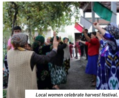
Local women celebrate harvest festival.