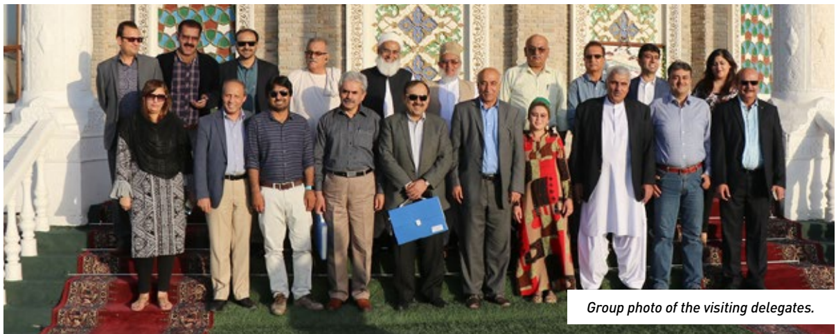
Group photo of the visiting delegates.