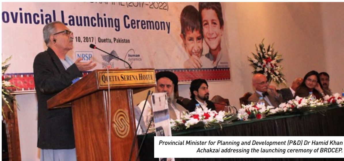
Provincial Minister for Planning and Development (P&D) Dr Hamid Khan Achakzai addressing the launching ceremony of BRDCEP.

The Local Government and Rural Development Department (LG&RDD) of the Government of Balochistan (GoB) collaborated with the Balochistan Rural Support Programme (BRSP), National Rural Support Programme (NRSP) and RSPN to organise the launching ceremony of the € 45 million Balochistan Rural Development and Community Empowerment Programme (BRDCEP) on November 10, 2017 in Quetta.