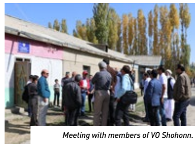
Meeting with members of VO Shohon.