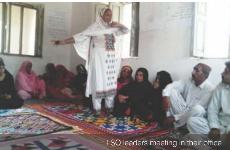
LSO leaders meeting in their office

One of the government schools had no boundary walls. The LSO approached TRDP for support. The TRDP provided funds from a project and constructed the boundary wall. The LSO also contributed some funds collected from their own members to complete the project.