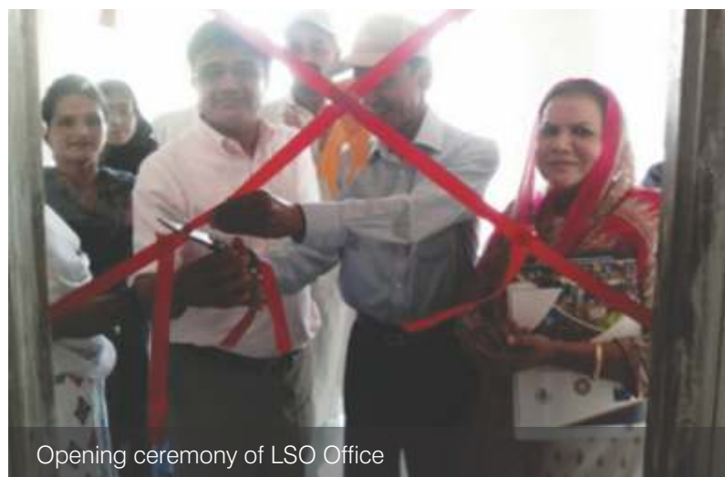
Opening ceremony of LSO Office

The LSO leaders learnt that in three villages close by Manchar Lake that have no health facilities there was a serious outbreak of measles among children as well as diarrhoea and skin diseases among both children and adults due to pollution of water. The LSO brought the issue in the notice of the Government Health Department and offered their support in arranging Medical Camps in the effected villages. As a result of this quick response, the Health Department immediately arranged three Medical Teams with vaccines, necessary medicines and testing equipment in these villages. The Medical Teams vaccinated the children against measles and treated both children and adults suffering from diarrhoea and skin diseases.